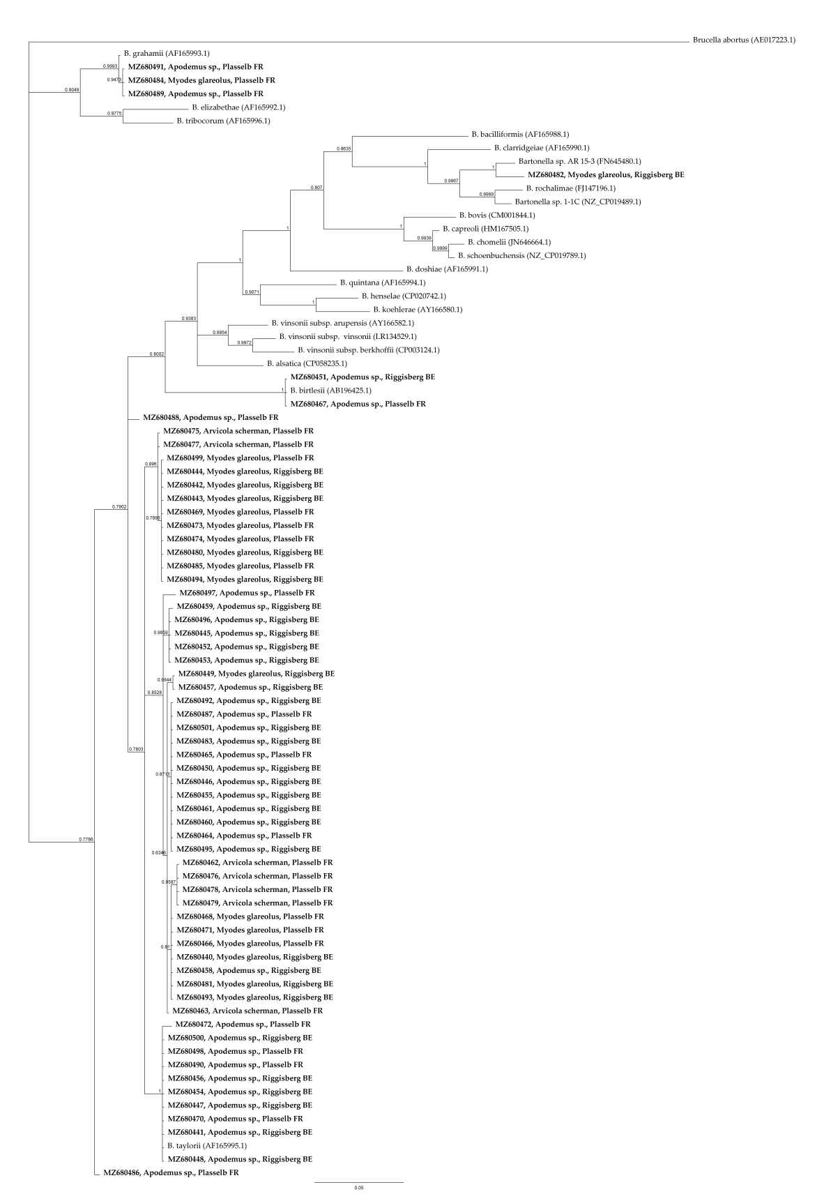
Figure 2. Phylogenetic tree based on the rpoB (682 bp) partial sequences of Bartonella spp. Sequences identified in the present study are indicated in bold (GenBank accession number, host, and site of trapping) and sequences from GenBank are indicated as common name and GenBank accession number in bracket. The phylogenetic tree was constructed using Bayesian inference method with the MrBayes plugin in Geneious Prime version 2021.2.2, with 1,100,000 chain length, 100,000 burn-in length. Brucella abortus was used as outgroup.