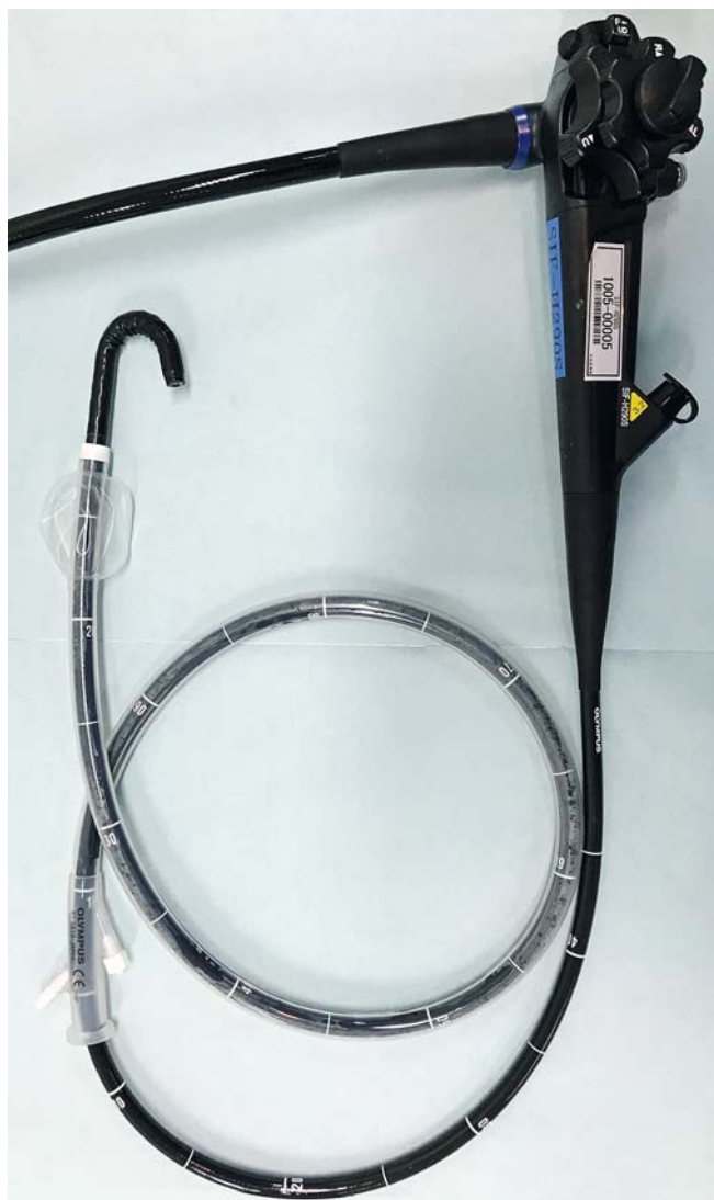
▶ Fig. 1 Newly designed short-type single-balloon endoscope (short SBE) (SIF-H290S) with a sliding tube.