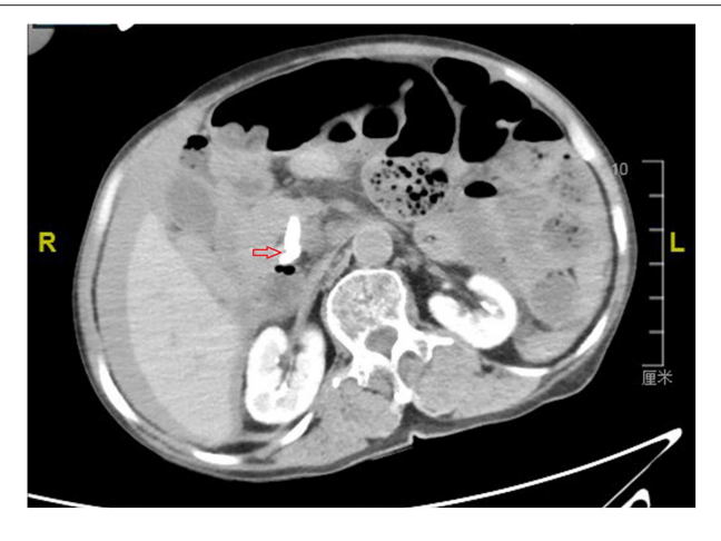
FIGURE 3 | Computerized axial tomographic scan showing the stone of the common bile duct (arrow).