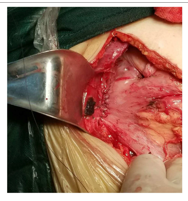
FIGURE 8 | Side-to-side anastomosis of the bile duct and duodenum.

severe acute complication of surgery in the abdomen. The condition is dangerous, requires urgent attention and has a high mortality rate. Therefore, clear diagnosis, accurate positioning, and timely treatment are crucial for the prognosis of patients.