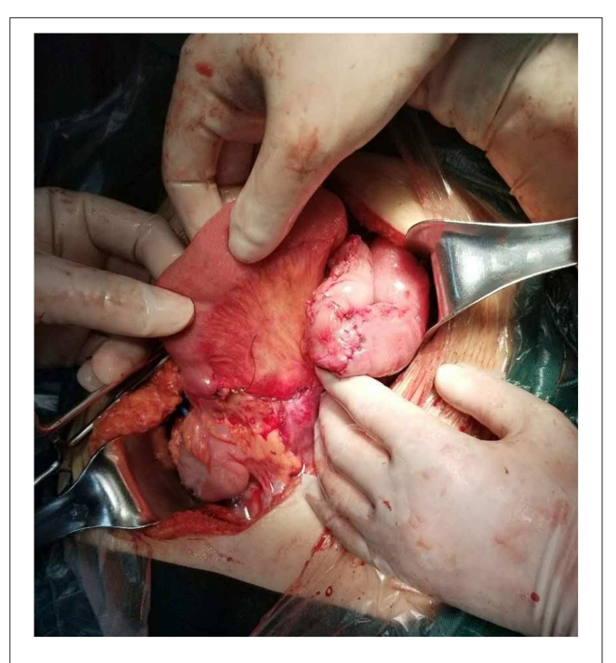
FIGURE 7 | Jejunum of interposition anastomosed between the remnant jejunum and ileocecal junction.