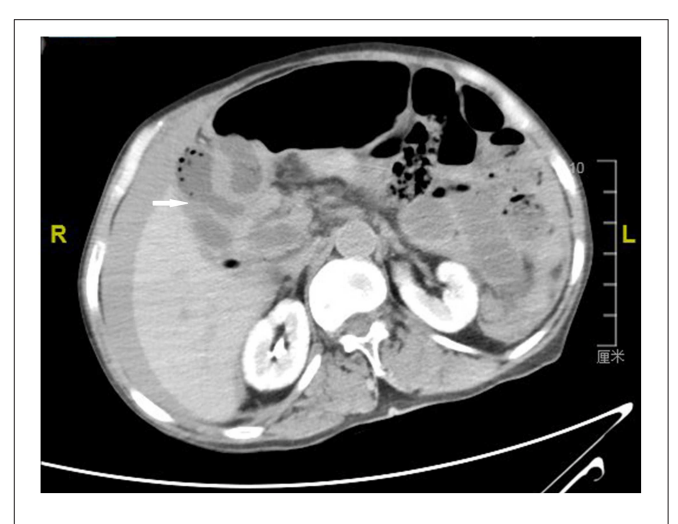
FIGURE 1 | Computerized axial tomographic scan showing the original choledochojejunostomy (arrow).

During the operation, \sim 2,000 mL of odorous dark red effusion was observed in the abdominal cavity. The ileal loop was herniated from the back of the anti-adverse peristaltic loop of the original choledochojejunostomy, and the mesentery was twisted counterclockwise. Near the root of the rotated mesentery, there was an annular adhesive cord band that compressed the twisted mesentery and the intestine. After separating the adhesive cord band, we reduced the torsion of the intestinal tube, which revealed that the output intestinal loop above the ileocecal junction 5 cm and below the choledochojejunostomy