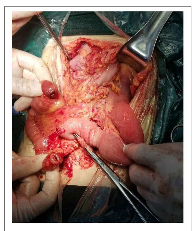
FIGURE 6 | Jejunum of interposition of the original choledochojejunostomy.

After reconstruction, the small intestine was \sim 60 cm. Preoperative examination suggested the presence of a common bile duct stone, and intraoperative exploration of the ampullary calculus of the common bile duct was dilated. To reduce the impact of surgical trauma on the body, we decided to perform side-to-side anastomosis of the bile duct and duodenum (Figure 8). We dissected the intestinal wall at the junction between the duodenal bulb and the descending part of the duodenum and anastomosed \sim 1 \text{ cm} below the original choledochojejunostomy; Varus anastomosis was performed on the anterior and posterior intestinal walls and the muscular layer of the anterior wall was strengthened. Finally, a gastrostomy was performed to avoid the reflux of gastric contents through the biliary tract due to excessive pressure. The operation time was 2.5 h. After the operation, the patient recovered successfully and was discharged uneventfully 11 days later. During the followup of over a year, the patient did not present with diarrhea or other discomfort.