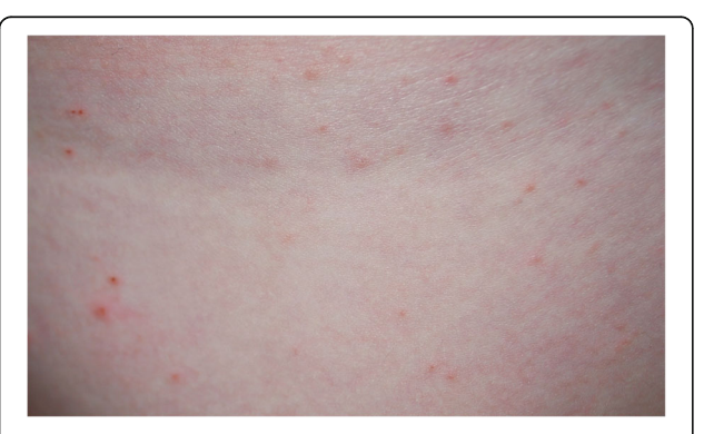
Fig. 3 Papules and erythema on the leg of the infested child

Both miniature pigs remained hospitalized for 14 days. During this time, an adequate feeding regime was started and a heating source was installed to control body temperature. Both pigs were treated with a subcutaneous injection of ivermectin (0.3 mg/kg; Ivomec*; Merial Ltd, Duluth, GA, USA), which was repeated after 2 weeks, combined with an intramuscular injection of butafosfan and cyanocobalamin (vitamin B12) (0.3 ml/kg; Catosal* 10%; Bayer, Shawnee Mission, KS, USA). Furthermore, the severely affected miniature pig was washed with a 3% chlorhexidine shampoo (Pyoderm; Virbac*, SA, Carros Cedex 06511, France) three times a week until scales and crusts resolved. The other miniature pig was washed only twice. No clinical adverse effects were observed throughout the treatment period. The owner