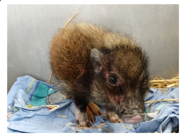
Fig. 1 Clinical photograph of the severely affected miniature pig with generalized hypotrichosis, multifocal hyperkeratotic crusts and environment.

Upon diagnosis of sarcoptic mange in this patient, the other miniature pig was also presented and examined. This animal showed a better body condition and comparable but milder skin lesions, consisting of mild hypotrichosis over the head and trunk and greasy skin with