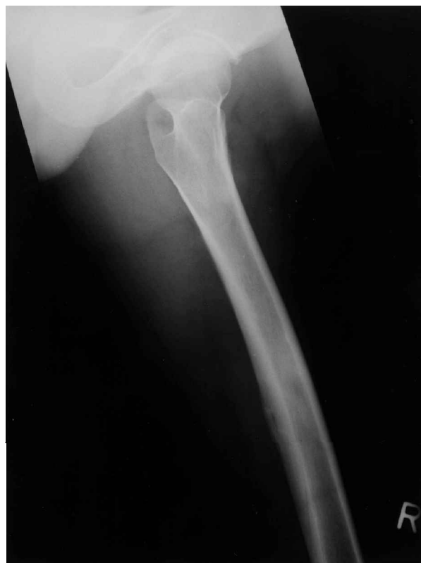
Fig. 1. Conventional radiograph of the femur shows generalized periosteal thickening with an area of bulging periosteum and a slight hypodense region within it. A soft tissue component is noted.

(2) A 27-year-old male patient was referred to our unit on October 1995 because of a painful growing mass in the medial aspect of his right thigh for 2½ months. His general condition was good. Physical examination showed a tender longitudinal lesion in the right mid-medial aspect of his thigh. There was no evidence of palpable lymph nodes in any locations. Blood tests, including ESR, WBC count, AP and LDH, were all normal. Conventional radiograph of the femur showed generalized periosteal thickening, with an area of bulging periosteum and a slight hypodense region within it. A soft tissue component was noted (Fig. 1). Our differential diagnosis was either a soft tissue tumor encroaching upon the bone or a malignant surface bone neoplasm. Staging studies included plain chest X-ray film; total body bone scan; CT of the lesion and chest and MRI of the lesion. As in the previous case, the CT and MRI of the thigh showed a periosteal/surface lesion without any involvement of the medullary canal (Fig. 2). Systemic bone