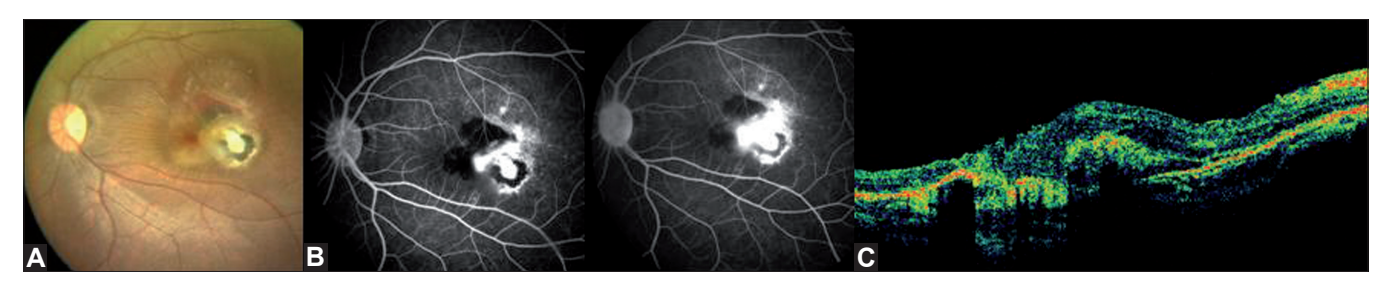
Figure 2: At presentation, left eye color fundus photograph (A) reveals a pigmented lesion at the macula along with a choroidal neovascular membrane, adjacent subretinal hemorrhage and fluid medial to the pigmented scar. Fluorescein angiography (B, C) reveals an active, subfoveal classic choroidal neovascular membrane with profuse leakage. Blocked choroidal fluorescence due to the overlying hemorrhage is also noted. Optical coherence tomography reveals subfoveal choroidal neovascular membrane and subretinal fluid adjacent to a subretinal scar