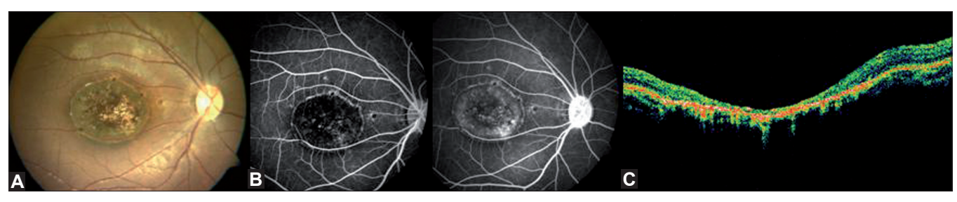
Figure 1: At presentation, right eye color fundus photograph (A) reveals a punched-out pigmented lesion with well-demarcated borders at the macula suggestive of a healed toxoplasma scar. Fluorescein angiography (B) reveals staining of the retinal scar. Optical coherence tomography reveals retinal atrophy corresponding to the lesion (C)