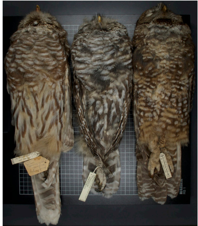
Figure 1 Comparison of eastern barred owl, Siskiyou County barred owl, and northern spotted owl plumages. This image displays the darker ventral plumage of a Strix varia collected in Siskiyou County, California compared with that of typical S. varia and S. occidentalis caurina individuals. On the left is the ventral plumage of a Strix varia from eastern North America. In the center is a S. varia from Siskiyou County, California. On the right is a S. occidentalis caurina from northern California.

Hybridization of Strix varia and S. occidentalis has previously been investigated using a set of four microsatellite (Funk et al. 2007) and fourteen amplified fragment-length polymorphism (Haig et al. 2004) markers, which the authors found useful for diagnosing F 1 and F 2