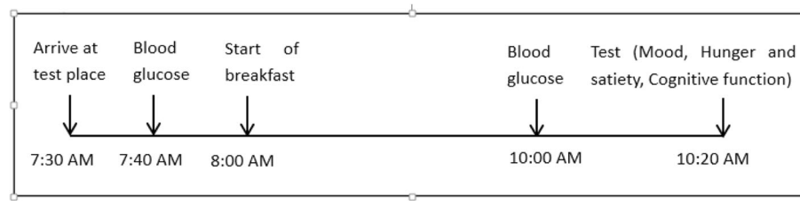
Fig. 2 The study process

The data will be collected and entered by trained staff members from the Liaoning Center for Disease Control and Prevention and Chongqing Medical University. Double entry will be performed, and the data will be compared to identify and correct any discrepancies.