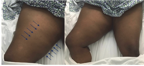
FIGURE 1: Diabetic myonecrosis involving the right thigh with overlying palpable skin induration (arrows). Enlargement of right thigh compared to left. Right leg was kept externally rotated.

C-reactive protein (CRP) 3.7 mg/dL (<0.9 mg/dL), and erythrocyte sedimentation rate (ESR) 68 mm/hr (0–20 mm/hr). Additionally, poor glycemic control was confirmed with random blood glucose of 569 mg/dL and hemoglobin A1c 13.8%. MRI of the right leg revealed diffuse subcutaneous edema in the right thigh, extending to the level of the knee, with diffusely increased T2 signal in the mid and distal thigh. Intramuscular fascial edema around the proximal hamstring muscles was noted, without any findings of abscess or osteomyelitis. Patient received analgesics, with optimization of glycemia, and was discharged home after physical therapy evaluation.