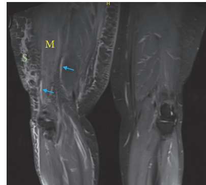
FIGURE 2: MRI leg without contrast. Right thigh musculature (M) and subcutaneous tissues (S) with diffuse swelling and edema-like signal on T1-weighted imaging. Fluid-like signal is noted at the fascial planes (arrows).

Diabetic myonecrosis is infrequently observed in patients with diabetes. The pathogenesis of diabetic muscle