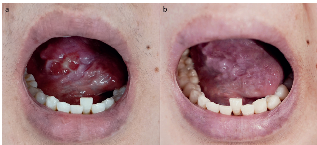
Fig. 2. Ulceration on the right lingual margin (a) before JAK inhibitor (JAKi) treatment, (b) with visible improvement after 4 months of treatment with ruxolitinib and reduction of cyclosporine from 100 to 50 mg per day.