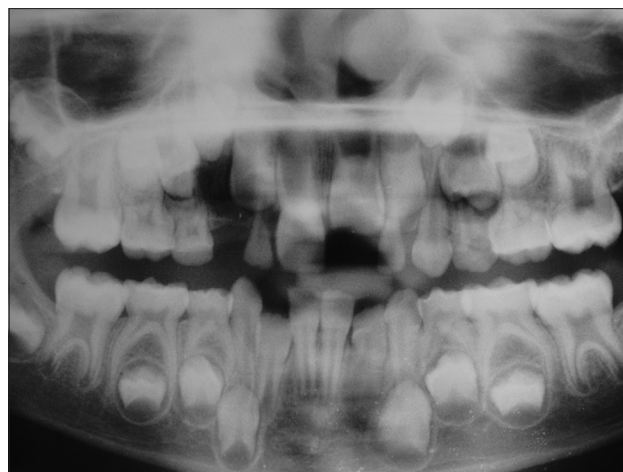
Figure 6: Postoperative orthopantomogram

stage, the lesion appears radiolucent due to lack of calcification and the second stage shows partial calcification followed by third stage that appears to be radio-opaque surrounded by radiolucent halo. Degree of calcification is less in primary dentition as in comparison to permanent dentition. [4]