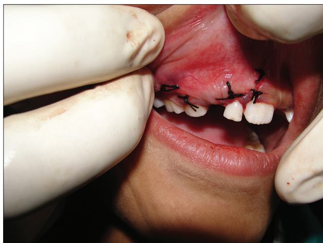
Figure 5: Sutures placed