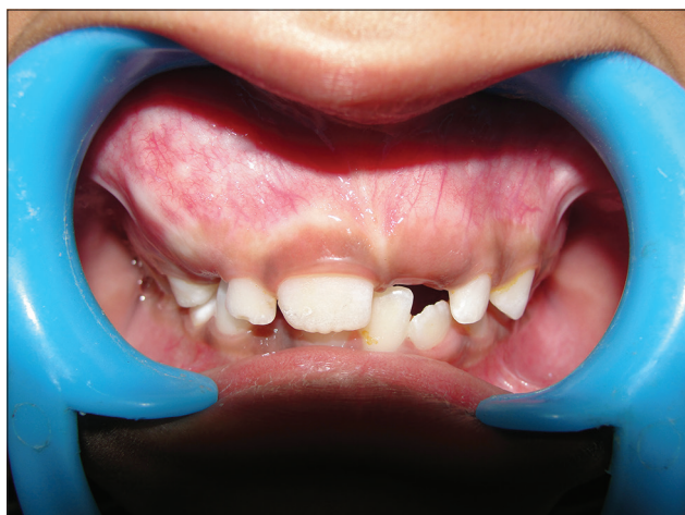
Figure 1: Intraoral examination

Radiographic characteristics are always diagnostic and characteristic. Radiologically, three different stages can be identified based on the degree of calcification. In the first