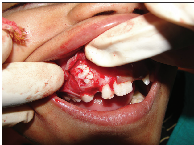
Figure 3: Exposed odontomas