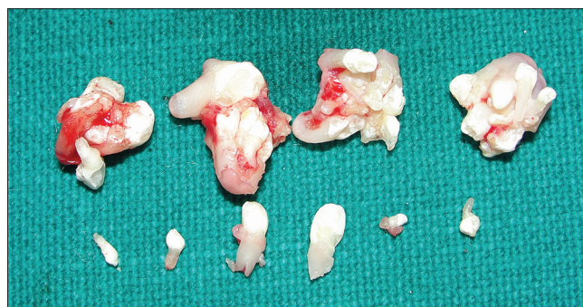
Figure 4: Removed odontomas