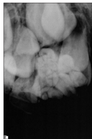
Figure 2: Intraoral periapical radiograph view