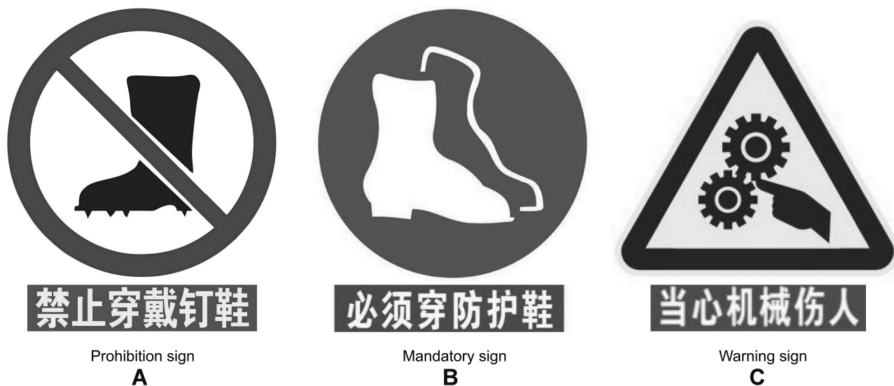
Figure 1 Examples of three types of safety signs: (A) A prohibition sign indicating “No putting on spikes”; (B) A mandatory sign indicating “Must wear protective shoes”; (C) A warning sign indicating “Caution, mechanical injury”.

experimental designs and proven to be feasible to investigate automatic information processing driven by stimuli. 6,22,44-46 Twelve pictures of prohibition signs, twelve pictures of mandatory signs and twelve pictures of warning signs were selected according to the recommendation list of the Chinese National Standard 17 as non-target stimuli (see Figure 1 as an example). We did not include guide signs in the present study since they have quite different physical features compared with the other three types of signs. Thus, it resulted in three main conditions, i.e., prohibition signs, mandatory signs and warning signs. Additionally, twelve neutral pictures of home products (e.g., desk) were selected as target stimuli. The participants were required to count the number of home products in the experiment. All pictures were processed to be grayscale images with similar brightness and contrast. Each picture was repeated three times in the experiment; thus there were 144 trials in total, with 36 trials in each condition.