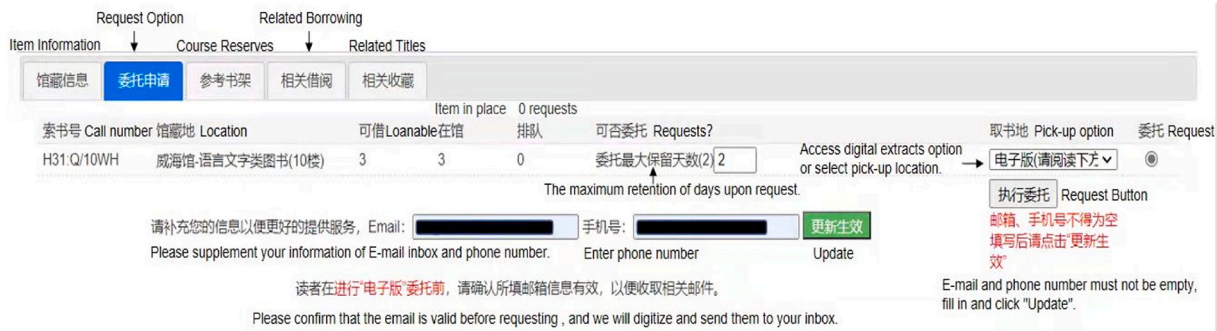
Fig. 2. Scan & send request library materials by OPAC.

Sockets Layer Virtual Private Network), followed by WebVPN (requires no installation and configuration, 71%), Single Sign-On (SSO) authentication (52%), managed by the University Office of Information Technology, Library e-Resources Remote Access System (43%), proxy technologies like RemoteXs or EzProxy (14%), and other methods such as username & password with authentication via the institution or institution email registration for vacation access by databases offering, and among the few libraries adopting OpenAthens/Shibboleth credentials remote access service. To enable access to the subscribed resources for off-campus users, the majority of libraries (60%) have acquired different types of remote-access tools (no more than three). It is interesting to note that at least one institute only allows graduate students and full-time faculty members to use VPN support. They need to apply for VPN accounts because the VPN infrastructure has a limited capacity.