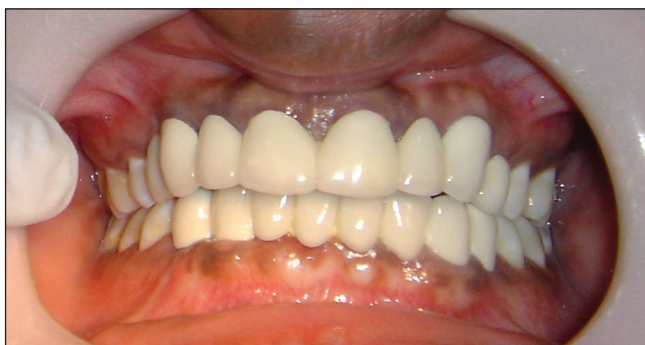
Figure 7: Frontal view after placement of final fixed restorations in the maxilla and mandible

esthetic and functional outcome of the treatment. The patient has been put on a strict maintenance program with a first year recall interval of three months, followed by a review once in six months to one year, based on the home care performance and assessment of the intraoral health status.