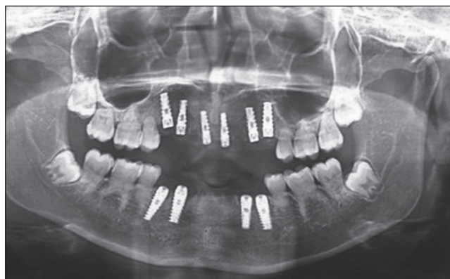
Figure 4: Implants placed in position in the maxillary and mandibular arches