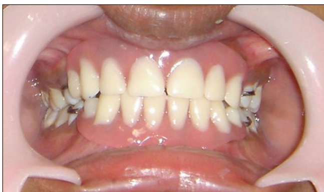
Figure 5: Maxillary and mandibular temporary partial removable prostheses in position