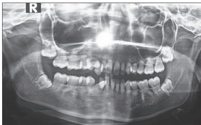
Figure 1: Orthopantomogram revealing the pathological changes. Note the generalized rudimentary or nearly absent root structures. Also note the absence of periapical radiolucencies and osseous pathologies

A 17-year-old female patient reported to the Department of Periodontology and Oral Implantology with a chief complaint of severe mobility of her upper and lower front teeth. She had started noticing the mobility since the past two years and it was noticed that the mobility had increased progressively over the years. This was the first dental visit for the patient and the past medical and social histories were noncontributory. There was no relevant familial history of the disease and hence the patient was considered to be a first generation sufferer. The clinical intraoral examination revealed the presence of normal color and morphology of the crowns of all teeth. Stable gingival and periodontal health was confirmed by a