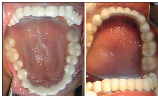
Figure 6: Maxillary and mandibular occlusal view of the final fixed prostheses