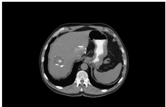
FIGURE 3. Computerized tomography showing hepatic hydatid cysts.