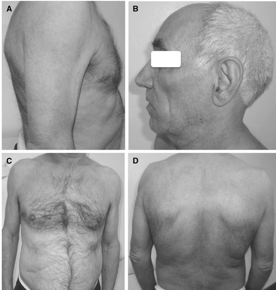
FIGURE 4. (A–D) Clear improvement of skin lesions, with (D) hyperpigmentation only in the trunk.