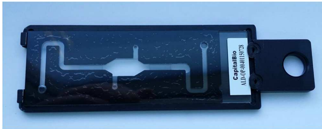
Fig 1A. Copy of the microarray