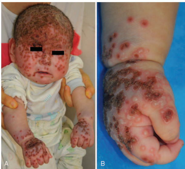
Figure 1. Clinical features before antiviral treatment. (A) Diffuse, erythematous, vesiculous, crusted, and eroded lesions in the areas of head, face, arms, and hands. (B) Vesicles in multiple phases on the back of right hand and right arm.

The vesicle fluid and crust were positive for HSV-2-specific DNA, whereas negative for HSV-1 on the real-time PCR (Light Cycler 2.0, Roche Diagnostics Corporation, USA) with HSV fluorescence assay kit (Da An gene Co., Ltd, China). After 4 days of treatment, the infant's condition had improved markedly with all vesicles crusted and his temperature returned to normal (Fig. 3A and B). Then the antiviral regimen was continued for another 5 days. The herpetic lesions had almost cleared by the seventh day of the start of the treatment (Fig. 4A and B). But the infant's parents reported that valacyclovir was only taken for the first 4 days as they worried about possible side effect of the antiviral agent. Meanwhile, they increased the frequency of wet dressing to 4 times daily without the occurrence of contact sensitization. In the follow up of 6 months later, there had been no recurrence.