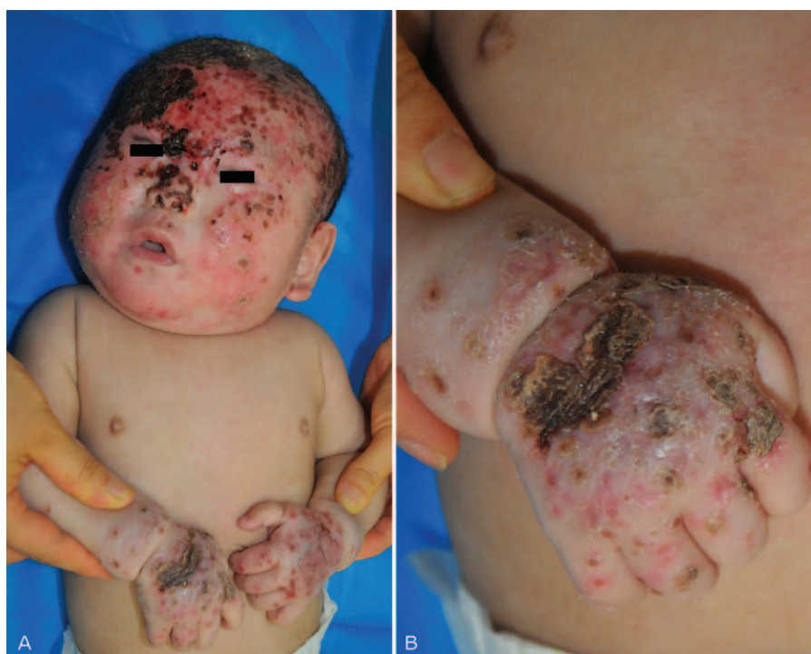
Figure 3. Change of the herpetic eruptions after 4 days of treatment. (A, B) The infant's condition had improved markedly with all vesicles crusted and his temperature returned to normal.

cases, whereas the oral acyclovir is administered in mild cases. The recommended dosage for oral acyclovir is 30 to 60 mg/kg/d, divided into 3 doses/d for 10 days. [2] The clinical utility of acyclovir, however, is limited by its low oral bioavailability and need for frequent dosing.