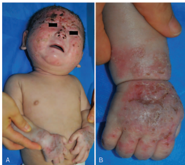
Figure 4. A complete remission was achieved. (A, B) The herpetic lesions had almost cleared by the seventh day from the start of treatment.

In summary, EH is a rare entity and the awareness for the sign of this herpes infection when diagnosing children with chronic skin disease should be increased. An exacerbation of atopic disease with a fever and sudden onset of vesiculopapular eruptions in a pediatric patient should raise a high suspicion of EH. Oral valacyclovir may be an effective and convenient treatment option for pediatric outpatients with EH.