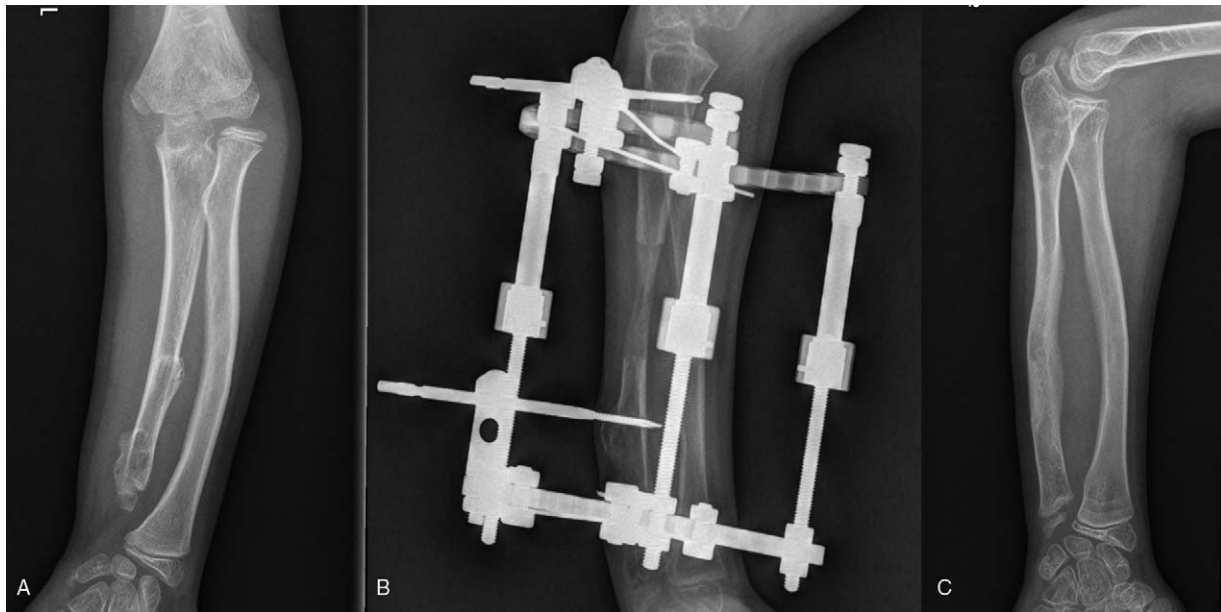
Figure 1. (a, b) The ulnar was gradual lengthened using a circular external frame, show a significant shorter bone healing index in this study, 3.8 cm were gained and the HI for this 10-year-old boy is 40.7 days/cm. (c) Radiograph of the forearm 14 months after external fixator removed, good relationship between the forearm bones and good remodelling of regenerate bone. HI=healing index

Statistical analyses were performed using the Statistical Package for the Social Sciences version 17.0 (IBM, Armonk, NY). Pearson's or Spearman's rho correlation analysis was used to assess the relationships between continuous variables or ordinal variables. For nonparametric data, the Mann–Whitney U test was used to check for significant differences between groups. Stepwise linear regression analysis was used to identify the influencing factors. The dependent variable was HI and the