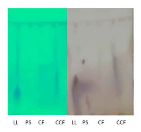
Fig. 3. TLC of laminin layer (LL), protoscolex (PS) and cyst fluid (CF) glycan antigens with condensed crude CF (CCF) antigen as a control. Left image is without staining under UV light and right image is with staining.

hydrate moieties and modulates host immune responses (42).