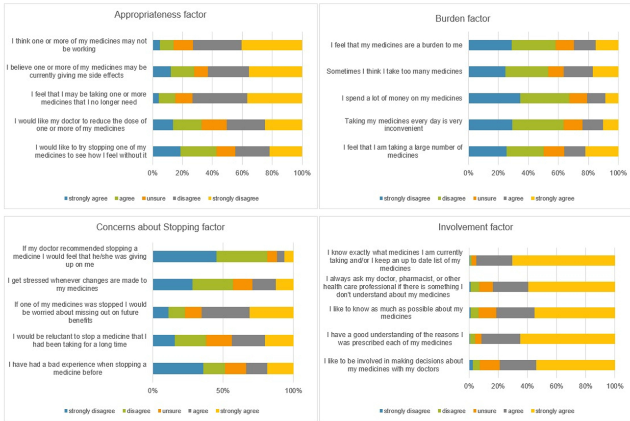
Figure 1 Responses to rPATD questions.

preferring telephone calls to pharmacy visits. Younger participants also chose “no follow-up” more frequently than older participants ( \chi^2(4) = 13.05; p= 0.011 ).