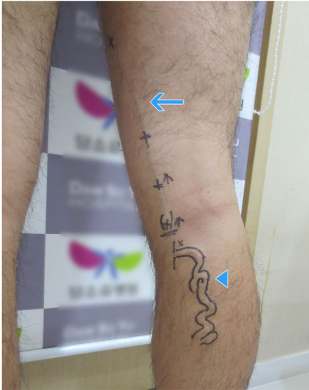
Figure 1: Photograph of posterior accessory saphenous vein (arrow) and its tributary (arrow head).

Normal GSV without reflux was observed in the saphenous compartment of left lower limb. On right lower limb, GSV became hypoplastic about 3 cm below the SFJ. The PASV connected the normal GSV 3 cm distal to the SFJ and normal GSV below the knee. Significant reflux (reverse flow lasting more than