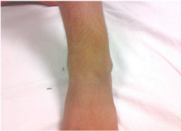
Figure 1 Clinical photograph of a patient showing lesion over lateral aspect of ankle.

The patient was initially put in an ankle foot orthosis. The nature and prognosis of the condition was discussed at length with the patient and his family and operative intervention was planned once an informed and written consent was obtained. An MRI scan was ordered once the decision was made to undertake operative intervention. It was consistent with a large, broad based benign osteochondroma arising from the lateral aspect of distal tibia with an uncalcified cartilagenous cap (Fig. 6). This led to a marked pressure erosion of the distal fibula, which was only 5 mm thick at the narrowest point (Fig. 5).