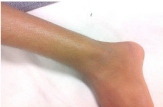
Figure 2 Clinical photograph showing prominent swelling.

The patient underwent excision of the osteochondroma through an anterior approach without fibular osteotomy. Intra-operatively, the fibula was found to be quite thin and weak. However, its outer cortical shell was intact. The