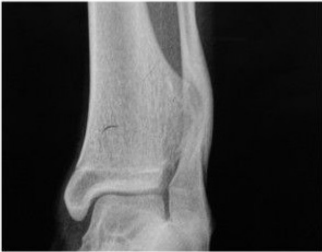
Figure 5 Oblique view showing erosion and impending fracture of fibula secondary to tibial osteochondroma.

ery with full return of ankle functions. The fibula had recovered the full thickness. There was no evidence of recurrence and he is still under follow up.