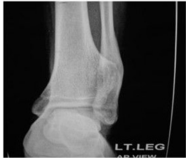
Figure 3 AP radiograph of ankle of a patient showing well defined exostosis arising from interosseous border of tibia pushing fibula.

inferior tibio-fibular joint was stable. Histology confirmed the clinical diagnosis of osteochondroma with no malignant transformation. Post-operatively, the patient was mobilised, non-weight bearing in a below knee plaster, for four weeks. Further mobilisation was undertaken with a gradual transition from partial to full weight bearing. At one year follow-up, he had made a complete recovery.