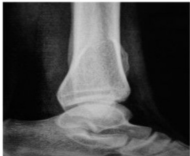
Figure 4 Lateral Radiograph of ankle of a patient showing well defined exostosis arising from interosseous border of tibia pushing fibula.

inferior tibio-fibular joint was stable. Histology confirmed the clinical diagnosis of osteochondroma with no malignant transformation. Post-operatively, the patient was mobilised, non-weight bearing in a below knee plaster, for four weeks. Further mobilisation was undertaken with a gradual transition from partial to full weight bearing. At one year follow-up, he had made a complete recovery.