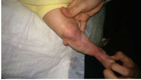
FIGURE 4: Healing of the lesions with conservative treatment.

Epithelialization process on the lesions was noted on the tenth day of hospital stay and the infant was discharged. As shown in Figure 4, the wound healing in this patient is rapid, efficient, and perfect.