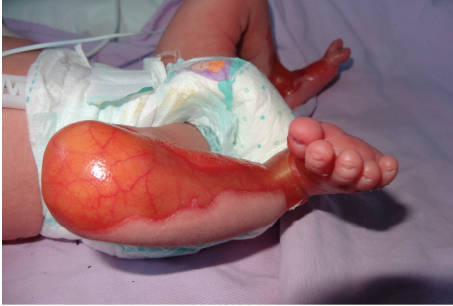
FIGURE 1: Sharply demarcated lesion margin.