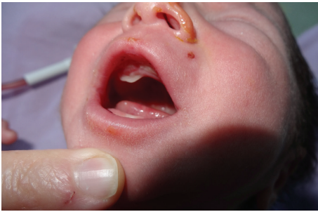
FIGURE 2: Blisters on the upper lip mucous membranes.

Patient was referred to dermatology. Physician recommended to allow the area to heal spontaneously by using conservative wound care such as topical antibacterial ointment and wet gauze dressing two to three times a day. The patient was treated by applying topical mupirocin (Bactroban) and wet gauze dressing (Bactigras) for 4 weeks and skin lesions had recovered substantially with appropriate therapy. The infant was discharged on the tenth day of hospital stay to continue local wound care by his mother.