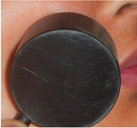
FIGURE 1: LIPUS application.

bilateral symmetry, and correct angulation of both canines were ensured. The incisors were secured together with 0.010-in steel ligature to prevent inadvertent tooth movement during the retraction phase. A horizontal force was applied by stretching a 6 mm close coil NiTi spring up to 150 g through Orthodontic Dynamometer (Forestadent, Germany) and held with a ligature wire between the power arm of the canine and first molar. Patients were told to meticulously maintain oral hygiene and to inform immediately if spring is severed or displaced. They were also discouraged to take analgesics and also advised to note it down if taken for the severity of pain.