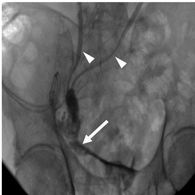
Figure 1 Anastomotic insufficiency (white arrow) in radiologic control. Small white arrows point at ureters.

A 83-year old patient in good medical condition underwent radical cystectomy and urinary diversion by Bricker ileal conduit for pT3a, G3, pN0, R0 urothelial bladder cancer. On the 3 rd postoperative day, wound drains showed fecal secretion and relaparotomy was undertaken. Intraoperatively, massive adhesions and ileoileal anastomotic insufficiency were found. Extensive lavage of the abdomen was performed, the former ileoileal anastomosis resected and reconstructed. Severe wound healing disorder occurred resulting in an open abdomen. A further relaparotomy and extensive lavage were performed on the 9 th postoperative day; despite massive adhesions full overview of the surgical site could be obtained. There was no macroscopic sign of anastomotic leakage at this point. As primary wound closure could not be achieved, open wound care was initiated consisting of wet saline dressings changed every two days following minor abdominal lavage. On the 16 th postoperative day, leakage of urine was suspected due to increased secretion of the wound and confirmed by radiographic imaging. Relaparotomy was mandated, ureteroileal anastomosis reconstructed and two nephrostomies placed. Persistent exudation led to the assumption of continued anastomotic insufficiency, which was confirmed by flexible endoscopy and radiologic control (figure 1). The leakage probably due to