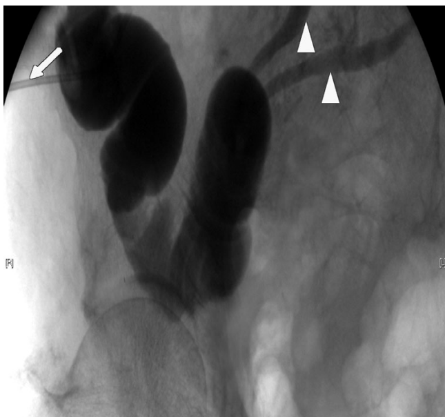
Figure 4 Resolved anastomotic insufficiency in radiologic control; contrast agent applied through catheter in ileal conduit (white arrow). Small white arrow heads point at ureters.

fistula resolved as demonstrated by radiological control (figure 4). For the remaining wound defect of the abdomen conventional wound care and secondary closure after 15 days were employed. Final endoscopic and radiologic controls of the conduit showed gradual mucosal coverage in the area of the anastomosis. The patient recovered well and was admitted to a rehabilitation unit. After a follow-up period of 13 months no further anastomotic insufficiency was noted.