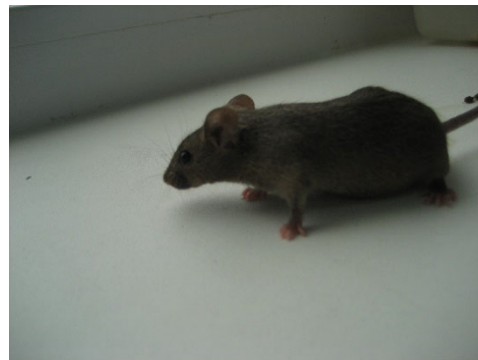
Figure 2. Clinically healthy (CBA \times C57BI/6) F1 hybrid male mice.

Clinically healthy (CBA \times C57BI/6) F1 hybrid male mice ( Mus musculus ) from the vivarium of Research Institute of Clinical Immunology, Siberian branch of the Russian Academy of Sciences, were used as warm-blooded animals. For scientific experiments, inbred mice with genetic homogeneity were used, ensuring the experimental results reproducibility. We observed the standard zoohygienic conditions for keeping animals (stocking density, airspeed, air humidity, water purity, bedding material, etc.) to obtain reliable data. For research, animals were kept in identical plastic cages, ten animals each, with free access to water (Figure 2). Feeding was carried out with natural food following the approved standards. The number of mice in the control and experimental groups was ten individuals, 8–10 weeks old, with a bodyweight of 23–25 g. All tests were carried out following the decision of the Local Ethical Committee, Research Institute of Fundamental and Clinical Immunology (Protocol No. 136).