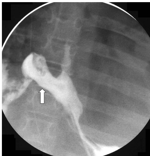
Figure 2 Distal esophageal pleural fistula. Under fluoroscopic guidance, a catheter was placed in the distal esophagus through a gastrostomy tube.

The patient's clinical condition improved quickly and he was off inotropic support in 2 days and back to his home ventilator setting in 3 days. The left chest tube was removed on day 6, but he continued to have persistent right chest tube drainage and positive culture with C. albicans for 2 weeks. Extensive humeral and cellular immunological testing and infectious disease evaluation including