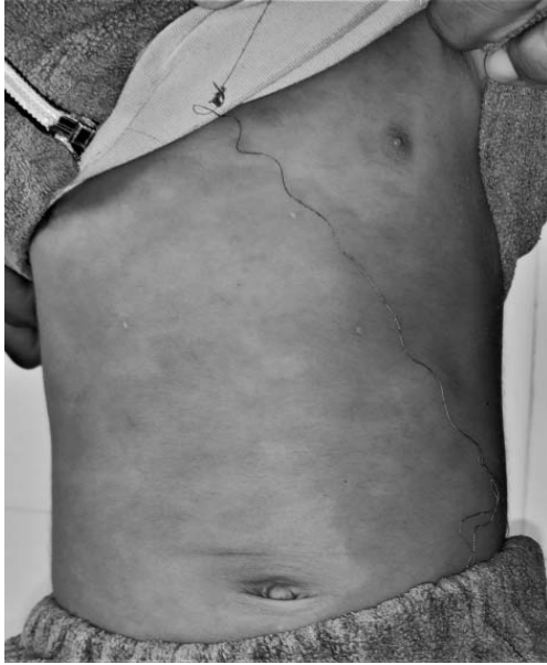
Fig. 1 Multiple annular polycyclic erythematous urticarial plaques on trunk.