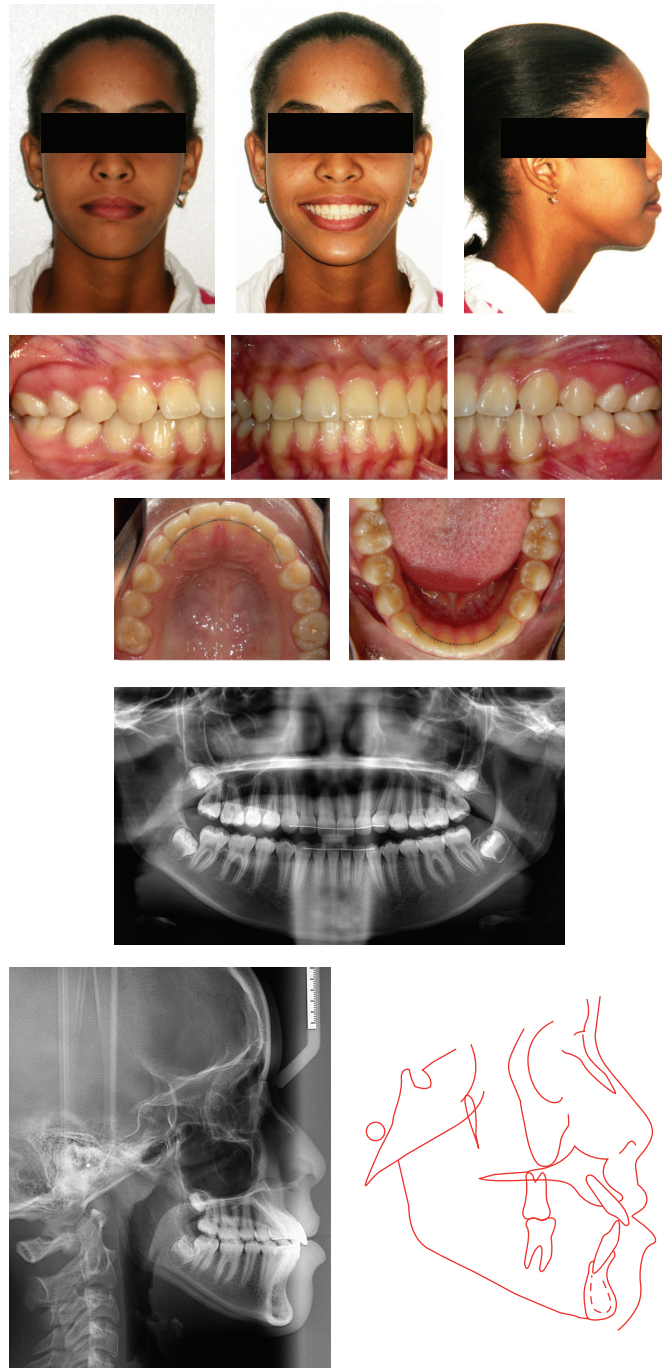
FIGURE 4: Posttreatment photographs and radiographs.

with a removable bite plane in the mandibular arch. After correcting the anterior crossbite, the use of the bite plane was suspended, and maxillary sequential bonding was performed visualizing a corrective orthodontic treatment in the second phase. A heat-activated 0.016'' \times 0.022'' NiTi arch wire was placed as initial arch, followed by a superelastic 0.017'' \times 0.025'' NiTi arch wire. The treatment of the mandibular arch began two months after inserting the maxillary 0.017'' \times 0.025'' NiTi arch; the arch wire sequence in the mandibular