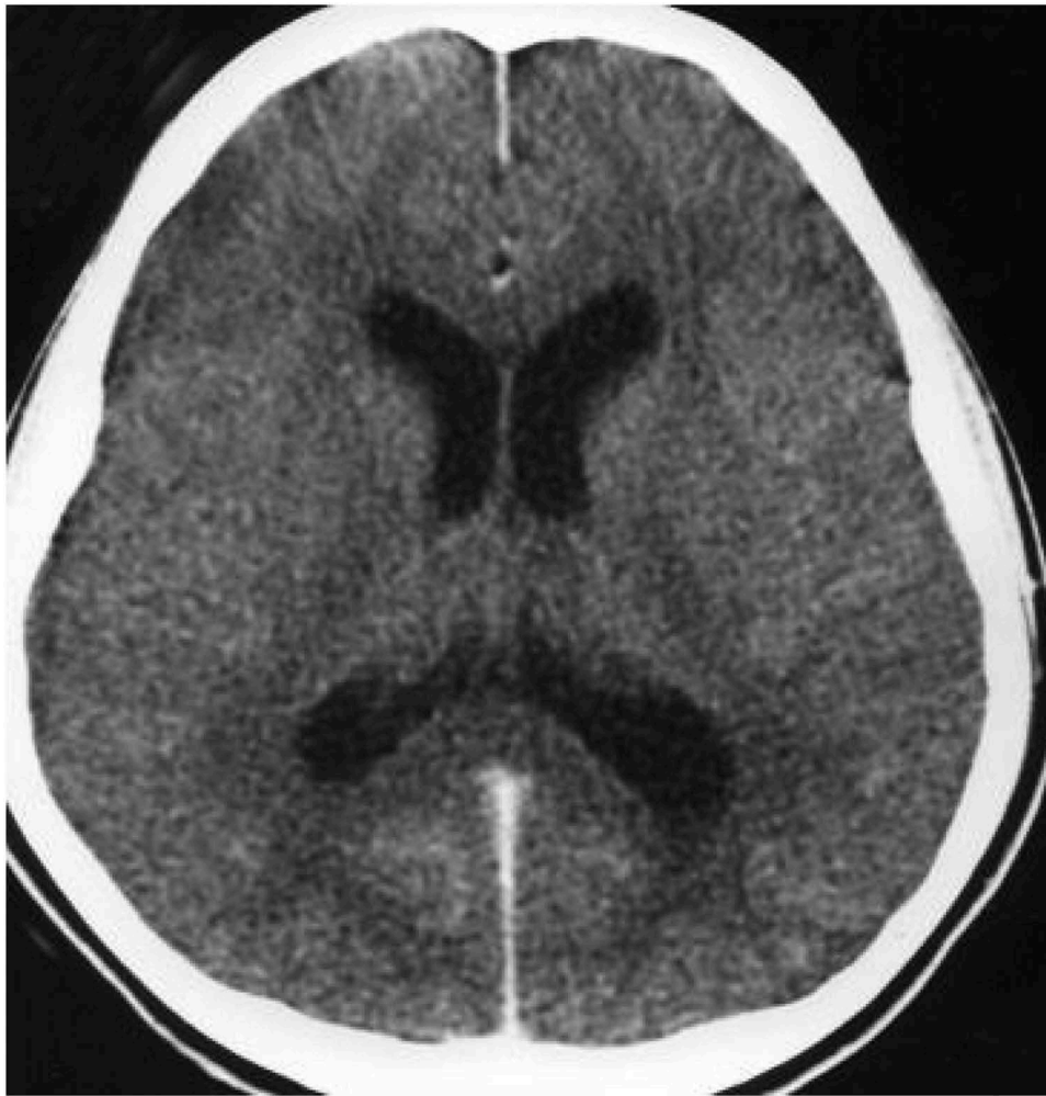
Figure 1. Computed tomography brain showed no signs of raised intracranial pressure or space-occupying lesion.

to the empiric antibiotic regimen. The culture showed a growth of Escherichia Coli in an immunocompetent adult, which is rare in immunocompetent as well as immunocompromised adults. The management of the patient was switched to meropenem and colistin based on the sensitivity of the organism and the patient has managed accordingly and was followed in ambulatory settings on a two-weekly basis.