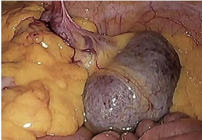
Fig. 2. Laparoscopic observation revealed the huge accessory spleen in the left abdomen. The color and elasticity were similar to those of the normal spleen.