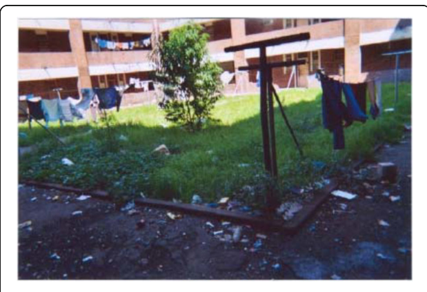
Fig. 1 Denver Hostel, Benrose, Johannesburg