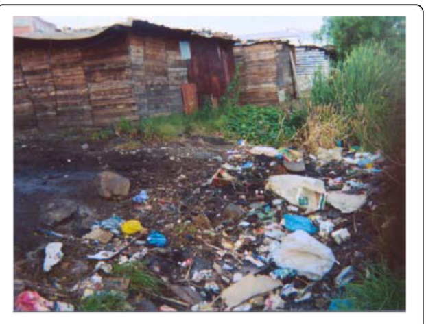
Fig. 2 Shacks in Mangolongolo Settlement, Benrose, Johannesburg

Hostel life was largely defined by overcrowded living conditions: 70% of the men surveyed shared a room with at least five other men, and as much as 44% shared with ten or more. Water and sanitation facilities were often lacking, with toilets reportedly unusable at least once in a month. Informal settlements surrounding the hostels were also described as overcrowded, and lacking in adequate sanitation and electricity (see Fig. 2). The latter problem in turn created a demand for alternative cooking fuels, such as paraffin, which posed a potential fire hazard. On average women had not lived in the informal settlements as long as men had been in the hostels: only a third of women had lived there for more than 4 years. Around half of the men (51%) had at least one child, but both men and women reported having to provide for a number of financial dependants on what was, for most, a meagre and erratic income. Some small businesses, such as car maintenance and shoe repairs, had sprung up in these informal settlements, alongside spaza shops (small informal grocery shops), shebeens (taverns), restaurants and butcheries. Seventy-six per cent of women interviewed and 56% of men stated that they were not working.