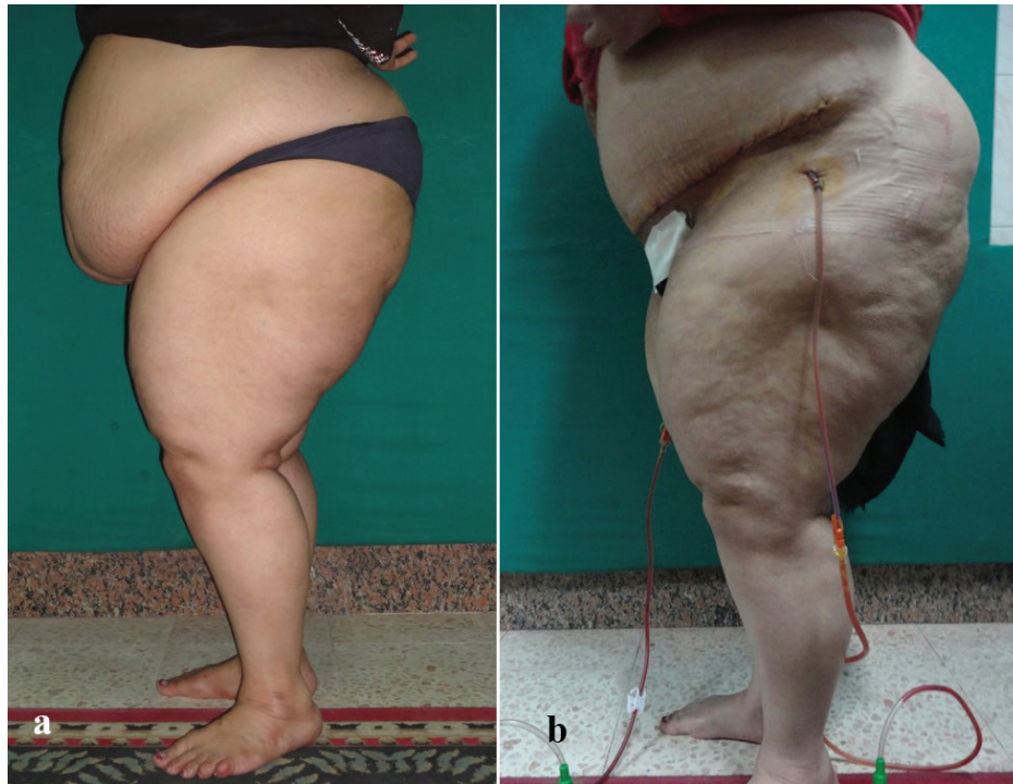
Fig. 5a, b: Preoperative and postoperative picture of abdominoplasty case with BMI >30 kg/m 2 .