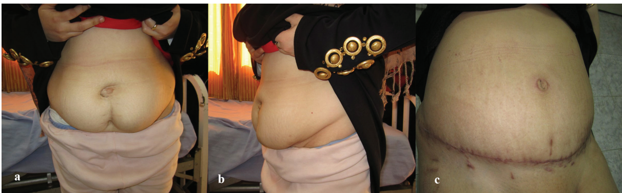
Fig. 2a, b, c: Preoperative and postoperative picture of abdominoplasty case with BMI <30 kg/m 2 .