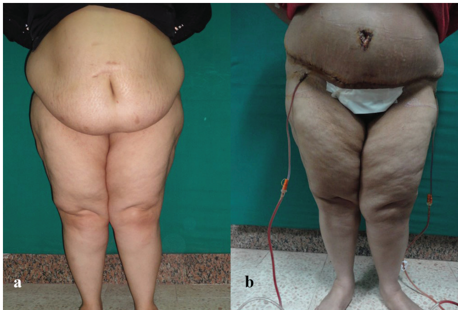
Fig. 4a, b: Preoperative and postoperative picture of abdominoplasty case with BMI >30 kg/m 2 .

Preoperative markings were crucial to successful surgery and to get desired symmetrical results. Patients were marked preoperatively in the standing position, and a transverse line was made just above the pubic hair extending laterally 7 to 18 cm in each direction towards the anterior superior iliac spine. Skin incision following the previously determined markings at the lower abdomen was done, sometimes a vertical incision from the umbilicus to the pubis was added to facilitate dissection. The umbilical scar was isolated (Figure 7) and dissection of the deep tissues was performed with electro cautery. Below