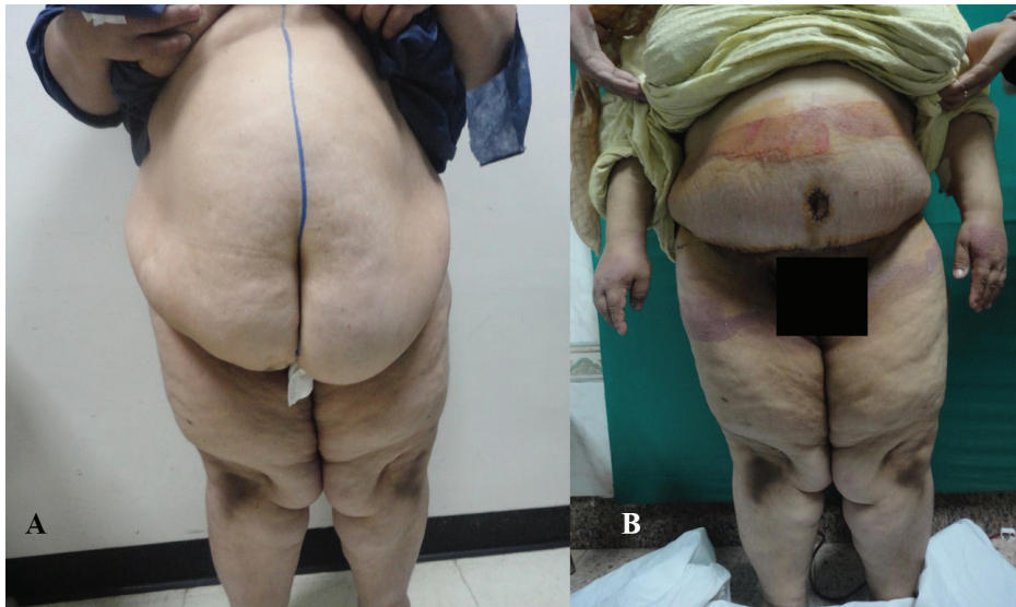
Fig. 3a, b: Preoperative and postoperative picture of abdominoplasty case with BMI >30 kg/m 2 .