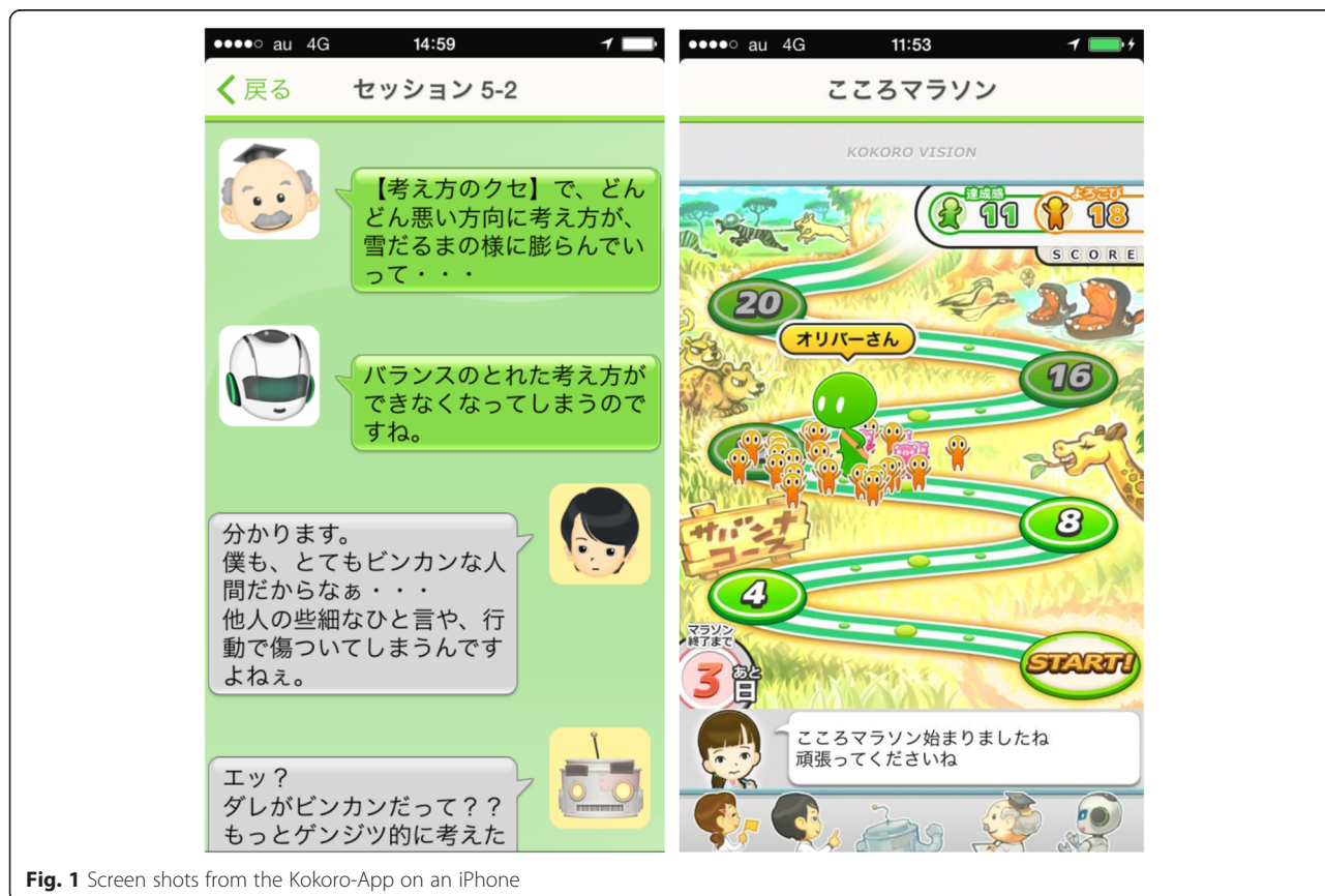
Fig. 1 Screen shots from the Kokoro-App on an iPhone

In the present study, antidepressants that the participants had been taking before entry to the study will be switched to escitalopram or sertraline. A systematic review and a multiple-treatment meta-analysis have suggested that escitalopram and sertraline are the most favorable in terms of the efficacy and acceptability among 12 newer antidepressants [10]. The attending physician will start escitalopram or sertraline at entry (week 0) and aim to stop antidepressants other than these two by week 5 and to prescribe either 5–10 mg/day of escitalopram or 25–100 mg/day of sertraline at week 5.