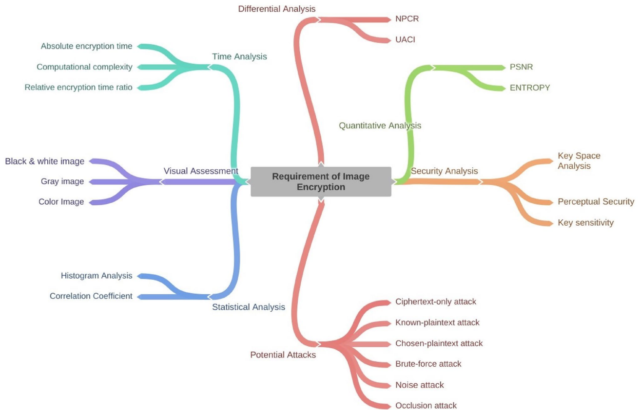
Fig. 2 Basic requirements of image encryption