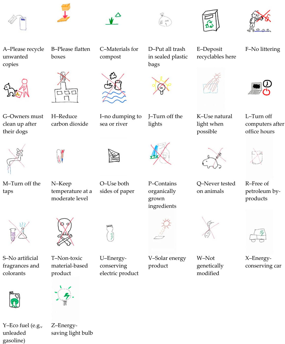
Figure 1. Samples of common representations for each environmentally friendly message from users.