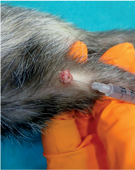
FIGURE 5. Intralesional injection of bleomycin into squamous papilloma (Tumour 4).