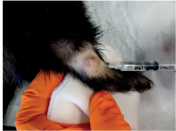
FIGURE 4. Intralesional injection of bleomycin into mast cell tumour (Tumour 2) located laterally on the right hock. Note the size of tumor and surgically challenging anatomical location.

In the first patient, both masses were diagnosed as MCTs, and in the second patient, squamous papilloma of hock region and sebaceous adenoma of chest region were diagnosed. Haematology,