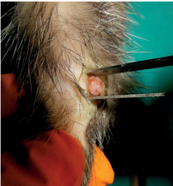
FIGURE 7. Electric pulses were delivered to the squamous papilloma (Tumour 4) using plate electrodes.