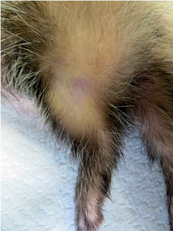
FIGURE 10. Complete response of squamous papilloma (Tumour 4) - 70 days after electrochemotherapy.

ti-tumour effectiveness, combined with excellent functional and cosmetic effects, while being less invasive than surgery. 8,10,11,12