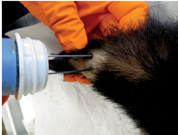
FIGURE 6. Electric pulses were delivered to the mast cell tumour (Tumour 2) using plate electrodes.

electrodes (distance between the electrodes: 6 mm) (Figures 6,7). Good contact between the electrodes and tumour mass was obtained by application of conductive gel to the treatment area. Electric pulses were generated by the electric pulse generator (Cliniporator™ - IGEA srl, Carpi [MO], Italy). The entire tumour was exposed to electric pulses by moving the electrodes perpendicular through the whole volume of mass and the surrounding skin, starting on the tumour periphery. The duration of each ECT cycle was approximately 15 minutes, and in both cases, the recovery from anaesthesia was uneventful. Meloxicam (Loxicom; Norbrook Laboratories) in a dose 0.2 mg/kg/day 9 was prescribed for 3 consecutive days orally after every cycle of ECT to reduce pain and inflammation.