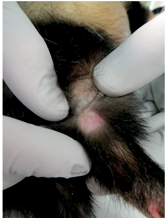
FIGURE 9. Complete response of mast cell tumour (Tumour 2) - 67 days after electrochemotherapy.

ECT with bleomycin as a single treatment was an effective treatment of cutaneous neoplasms; MCTs, sebaceous adenoma, and squamous papilloma in our cases. ECT was well tolerated by the patients and is a minimally invasive procedure with no major side effects noted, with excellent responses and long-lasting CR. In first patient, no tumour growth was seen during observation period of 15 months after ECT of the tumour located on the tail base, and 11 months after ECT of the tumour located on the right hock. In second patient, no tumour regrowth was seen 8 months after treatment. Different studies reported an excellent treatment response of ECT with cisplatin or bleomycin in tumours of different histology with minimal side effects in dogs 10,11 , cats 12 , horses 13 , pet rats 14 , and reptiles 15,16 . In our cases, only some muscle contractions of the