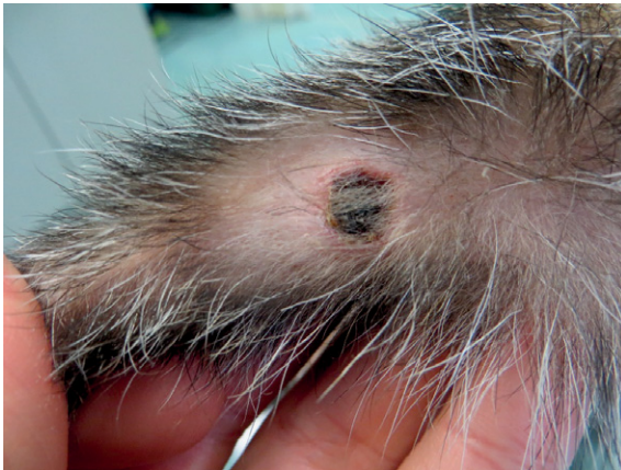
FIGURE 8. Necrosis with superficial scab of squamous papilloma (Tumour 4) 8 days after electrochemotherapy.

the MCT located on the laterodorsal tail base became necrotic on day 6 and a complete response (CR) was seen approximately 1 month after ECT, while the second MCT found on the lateral side of the right hock became necrotic on day 15 and CR was seen approximately two months (67 days) after ECT (Figure 9). In second patient, both tumours became necrotic on day 8 (Figure 8) and CRs were seen 70 days after ECT (Figure 10). In first patient, no tumour growth has been seen during the observation period of 15 months after ECT of the tumour located on the tail base, and 11 months after ECT of the tumour located on the right hock. In second patient, no tumour recurrence was detected 8 months after treatment.