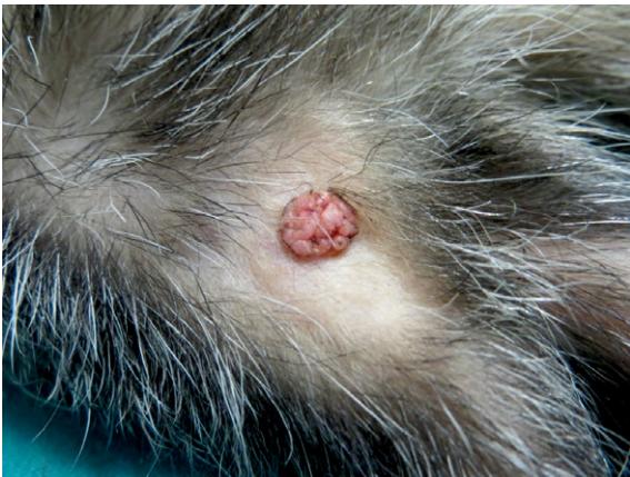
FIGURE 1. Macroscopic presentation of squamous papilloma (Tumour 4).

body. They are firm, warty and often multinodular, sometimes looking very similar to MCTs. They can be ulcerated, irritated and traumatised with local inflammation. 2,4