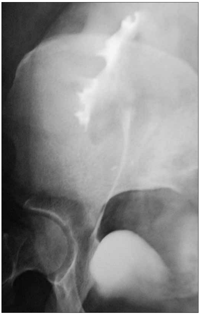
Figure 3. Urogram 18 months later.