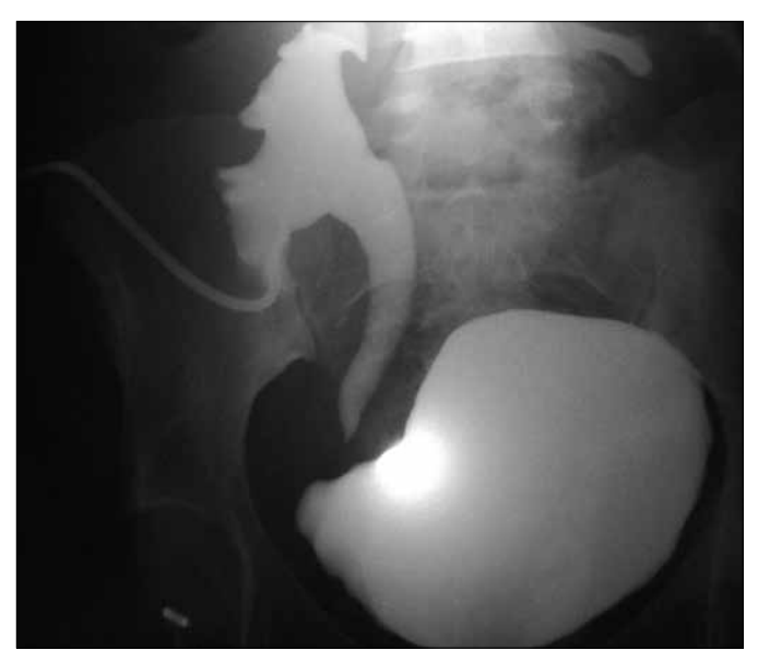
Figure 1. Preoperative pyelography.

In the past, the main treatment option was the surgical procedure that, in the hands of an expert surgeon, offers a high rate of success [3, 4]. However, with the development of the endourological approach, and because of the possibility of serious complications in open surgery, the endourologic treatment has become the first treatment option for these patients. The success rates reported are 60% to 95% by different authors, and the recurrence rate around 45% [5, 6].