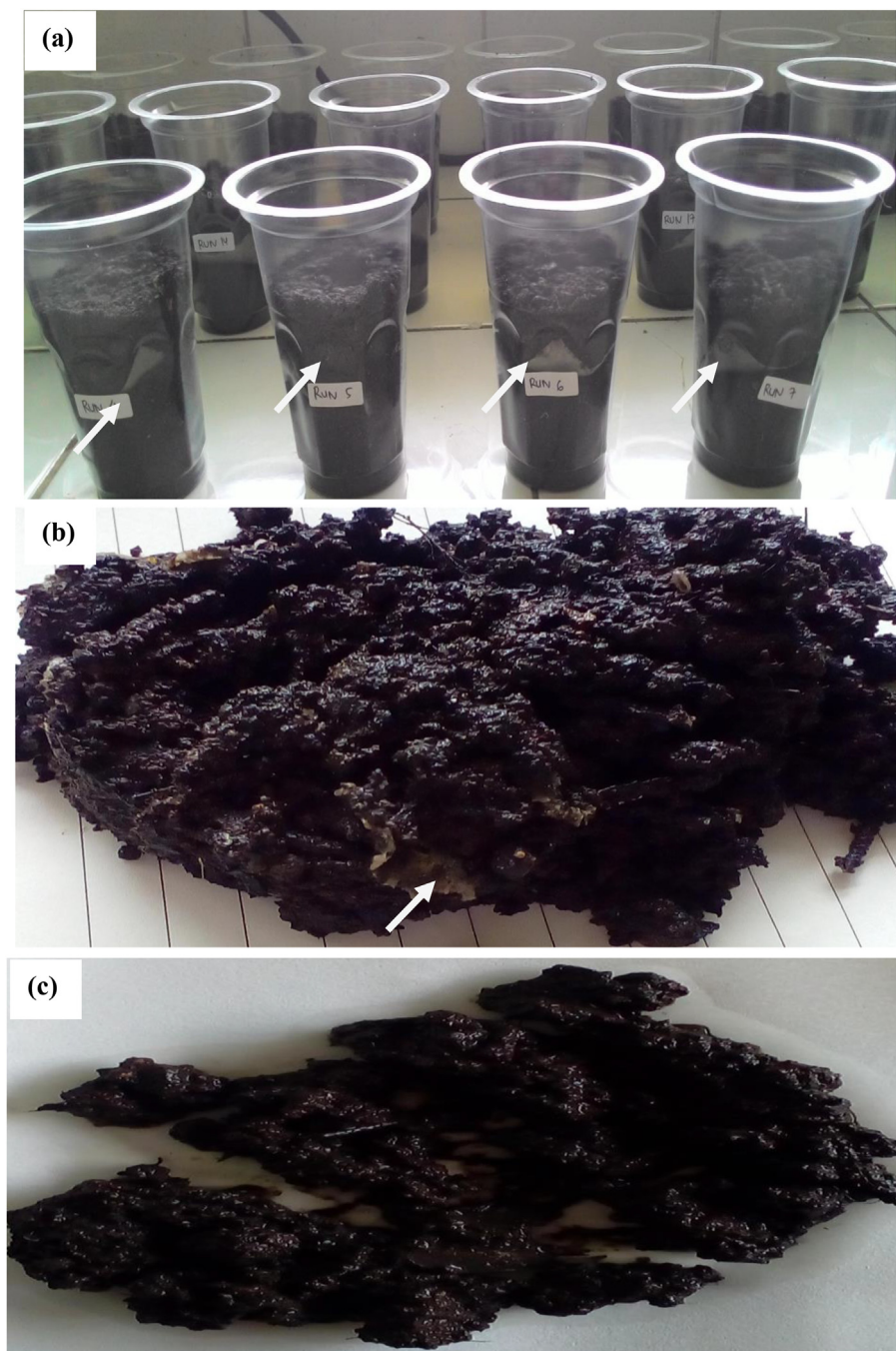
Figure 3. (a). Biodegradable film planted in pots filled with soil, the film sheet is clearly visible; (b). Observation of the biodegradable film test results in the first week still send the film sheets that have not been degraded; (c). Observation of the biodegradable film test results in second week, no film sheets were visible.

Increased peaks in hydroxyl areas occur in biodegradable films compared to waste seaweed pulp material due to the higher solubility of biodegradable film products. A strong band at 930.3\text{ cm}^{-1} indicates the presence of 3,6-anhydro-galactose residue which is the main structure of seaweed which has the ability to form a gel (Pereira et al., 2013). The peaks between 422\text{--}600\text{ cm}^{-1} are dyes such as chlorophyll and carotene originally present in native seaweed and then disappear in biodegradable film products (Indriatmoko et al., 2015). The peaks in the amorphous