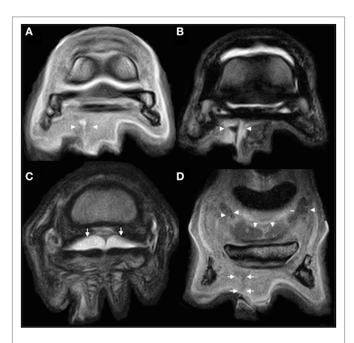
FIGURE 2 | MRI images of the right hind foot acquired at the time of presentation. Lateral is to the left of all images. (A,B) Slice matched transverse T1-weighted (T1W) gradient echo (GRE) (A) and T2-weighted (T2W) fast spin echo (FSE) (B) images at the level of the distal horizontal border of the navicular bone. The tract (arrow heads) can be seen as a hyperintense [in (A)] and hypointense [in (B)] tract extending from the lateral sulcus of the frog into the sub-solar tissues in both images. (C) Transverse T2W FSE image just proximal to the navicular bone within the proximal recess of the navicular bursa (NB). The bursa is seen to have marked effusion (arrows). There are no abnormalities associated with the tendon at this time. (D) T1W GRE frontal image at the plantar extent of the tract. The tract can be seen as an ill-defined hypointense tract just proximal to the lateral sulcus of the frog (arrow). Marked effusion of the NB can be appreciated (arrowheads).

of 62 g/l consistent with synovial inflammation but not sepsis (10, 11). Subsequent positive contrast bursography, using 4 ml iohexol (Omnipaque; GE Healthcare Ireland, Cork, Ireland), confirmed the integrity of the NB. The duration of needle placement was kept to a minimum and only that time required for confirmatory radiography, collection of a synovial sample, distension of the bursa with contrast material and, finally, serial radiography. The procedure was well tolerated, with the limb held stationary throughout centesis.