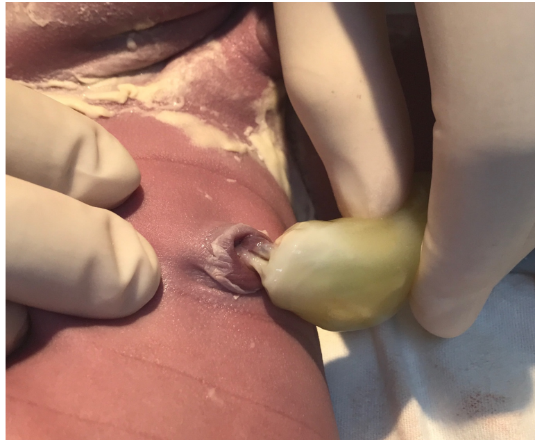
Figure 3. Absence of Wharton's jelly at the umbilical cord insertion.

A decision was made for a category 2 cesarean section. A healthy 3500 g male was delivered in good condition (Apgar score 8). The macroscopic placental examination was normal. During the first routine clinical examination of the neonate, a Wharton's jelly anomaly was identified at the abdominal umbilical cord insertion. For approximately 1 cm of length, umbilical cord vessels were completely uncovered by Wharton's jelly. The condition required surgical thread elective ligation of exposed umbilical cord vessels (Figure 3).