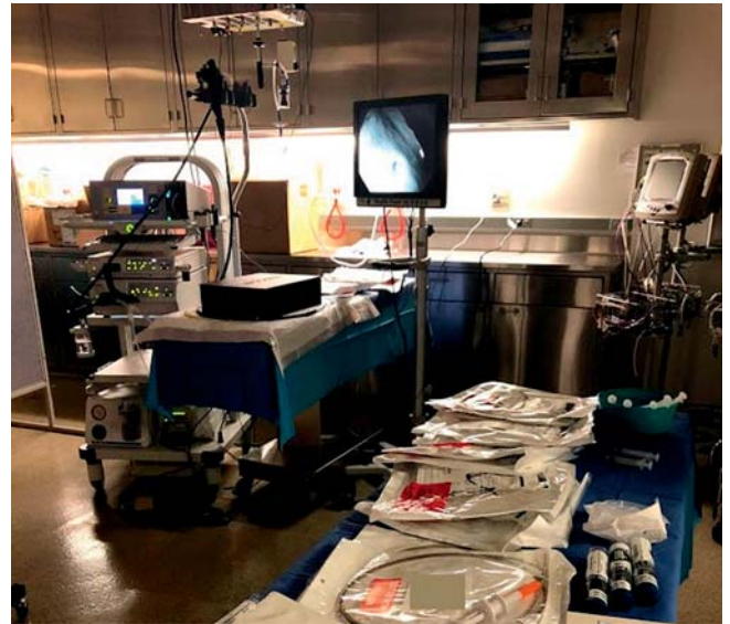
► Fig. 3 Set up of simulated polypectomy experience.

nurse (► Fig. 3). Participants first provided demographic data including age, sex, years in practice and estimates of the average number of colonoscopies and polypectomies (>5 mm) performed annually.