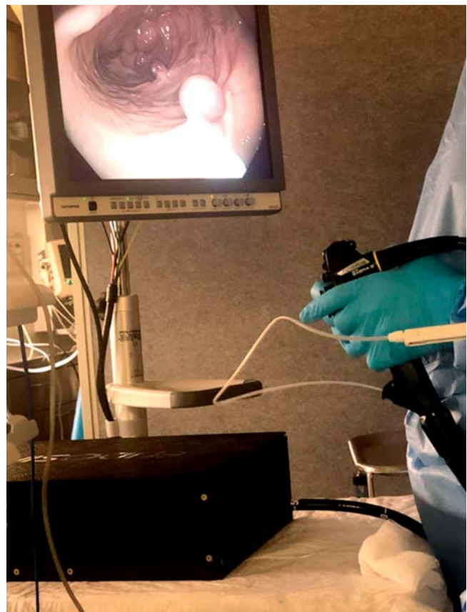
► Fig. 1 Simulated stalked polyp removal.

The simulation environment was designed to replicate an endoscopy procedure room with a complete colonoscopy tower, high definition colonoscope, standard polypectomy tools, electrocautery, and an experienced technician or registered