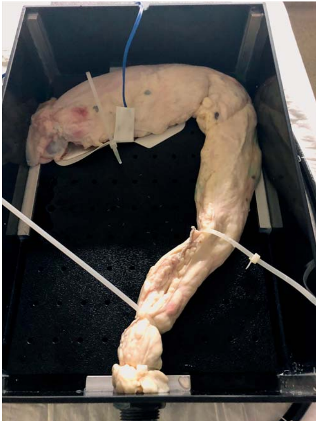
► Fig. 2 Simulation model configuration.