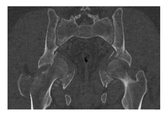
Fig. 1. Pre-operative coronal pelvic CT.

Following this he required inpatient rehabilitation for four months. On discharge home he was mobilising independently with two elbow crutches indoors and outdoors up to 40 m.