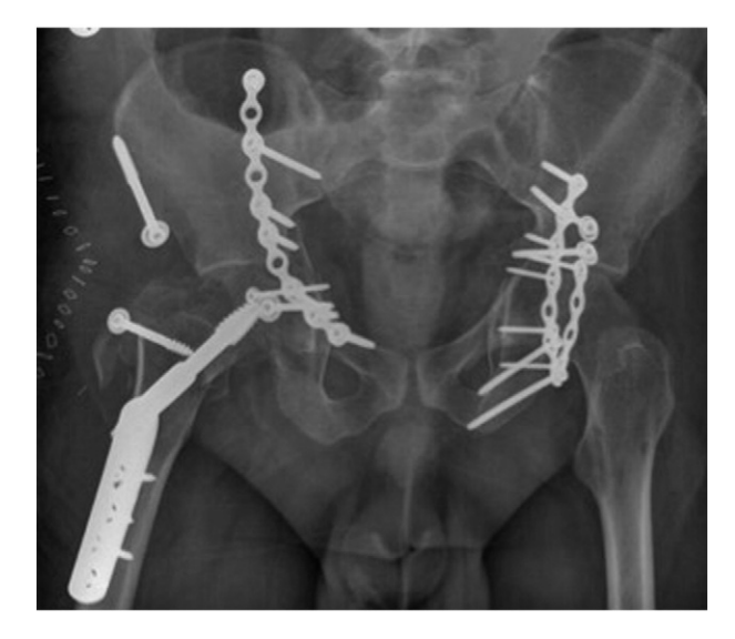
Fig. 2. Postoperative AP XR of the pelvis.