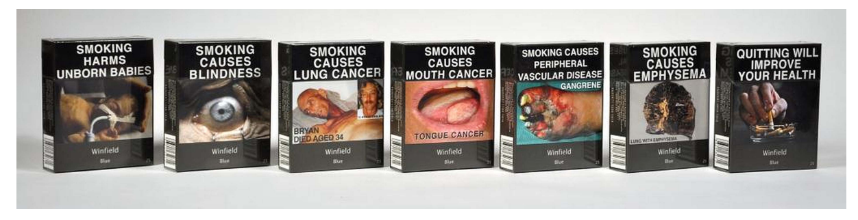
Figure 3 Winfield Blue 25s: packs showing the first set of seven health warnings.

1 December 2012 onwards now has to be one of several rotating messages (with information about chemicals in tobacco smoke, paired with, and relevant to, the particular GHW on each pack) presented in black text on a yellow background—see <a href="here">here</a> for image. This requirement was in line with market research which determined this updated format to be more noticeable. 8 26