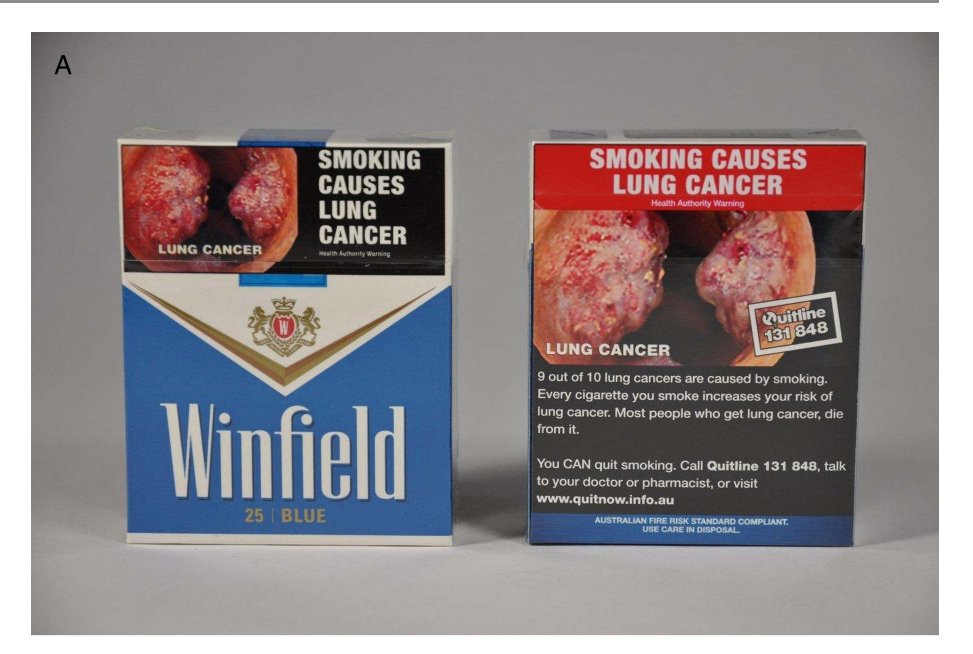
Figure 1 (A) Typical Australian tobacco packs, back and front before...(B)...and after the introduction of tobacco plain packaging.