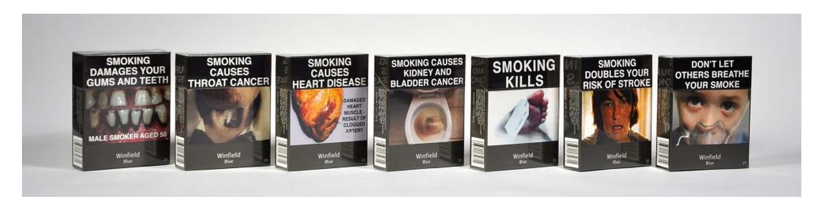
Figure 4 Winfield Blue 25s: packs showing the second set of seven health warnings.

Rotation requirements for the health warnings are set out in Part 9 of the Standard for cigarettes and other smoked tobacco products. The first set of warnings (described in Part 3 of the Standard) could be displayed on packs sold in retail outlets