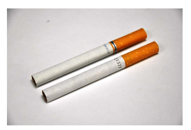
Figure 2 Horizon cigarette sticks before and after introduction of legislation.