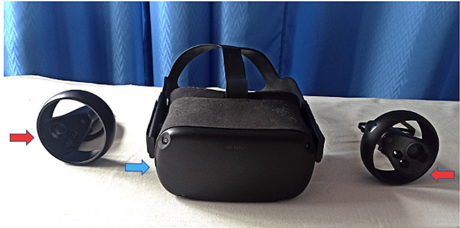
FIGURE 2: Oculus Quest used for inducing gamification with head-mounted display highlighted using blue arrow with handheld sensors demonstrated using red arrows

with red arrows) actively from the position at rest to maximally attaining the movements across all axes and planes namely pronation and supination of the forearm, flexion/extension and radial/ulnar deviation of wrist and flexion/extension, thumb abduction/adduction of fingers. Rehabilitation games aimed to help patients perform the above-mentioned exercises through the games developed solely for the rehabilitation of patients following DRF. The games used were 3D immersive representations of contour, position, and movement combined with gestural control in the sensor motion virtual environment. These games provide an interactive, engaging, interesting, and real-time enhancement of movement using a cognitive training technique during rehabilitation. The games included were Racket: NX game (One Hamsa, Tel Aviv, Israel), in which the aim was to imitate the movement of the wrist, elbow, and shoulder joint by whacking the ball with the racket into the glowing target as they appear; Until You Fall (Schell Games, Pittsburg, USA) game in which wrist flexion and extension with either pronation or supination of the forearm was to be executed for controlling and swinging the sword on an aesthetic battlefield; and Holofit game (Holodia, Strasbourg, France), where the patient concentrated on the rowing or skiing movement of the hand imitating the combination of flexion or extension with ulnar deviation or radial deviation. The upgrading of the level provides resistance to the interface.