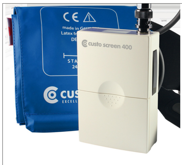
Figure 1 Custo screen 400 test device.

To initiate ABPM, the custo screen infrared interface must be connected to the computer and be ready for operation. After selecting a subject, different parameters have to be set, including measuring intervals (standard or customized), time for day and night phases or additional phases, the option for repeated measurements, signal before measurement (beep), display results, and print diary. The display of the device indicates systolic and diastolic BP (SBP and DBP, respectively) values together with heart rate and an error code in case of failure. When the measurements are complete, data are downloaded via an infrared interface. The quality of the recording, including invalid measurements and their underlying causes, can be checked.