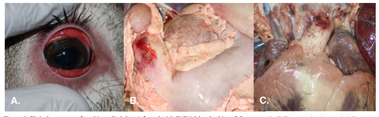
Figure 3 Clinical outcome of a white-tailed deer infected with EHDV-7 by the bite of C. sonorensis. A ) Photograph taken on 9 dpf just prior to euthanasia showing prominent erythema of periorbital skin and severe congestion and edema of the conjunctiva. B ) Paintbrush hemorrhage in the wall of the abomasum at the level of the pylorus. C ) Subintimal hemorrhage at the base of the pulmonary artery. [Both B ) and C ) are considered classic lesions of acute hemorrhagic disease in WTD.].