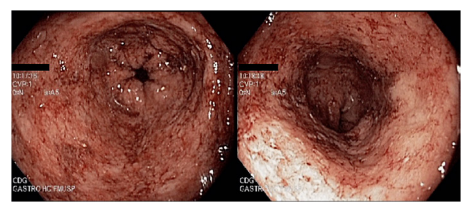
Fig. 2. Rectosigmoidoscopy revealing areas of spontaneous bleeding and multiple erosions and superficial ulcers, covered with fibrin and hematin.