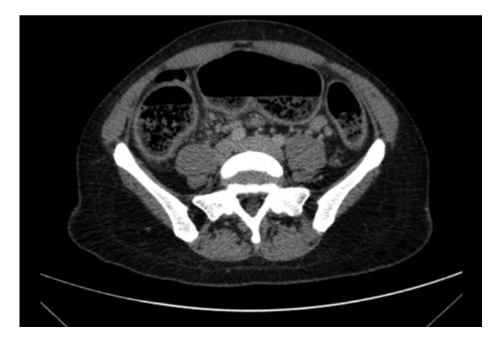
Fig. 1. Abdominal pelvic CT scan showing thickness of the colonic wall, moderate bowel distension, diffuse densification of the fat surrounding the cecum, and a diffuse increase in the number of locoregional lymph nodes.

[6]. One day after discharge, the patient started with symptoms of dry cough and runny nose. The symptoms progressively intensified and she was readmitted to the hospital 4 days later. At that point, the patient had mild dyspnea, but without oxygen desaturation. Considering the pandemic scenario, nasopharyngeal and oropharyngeal swabs revealed that she was SARS-CoV-2 PCR positive.