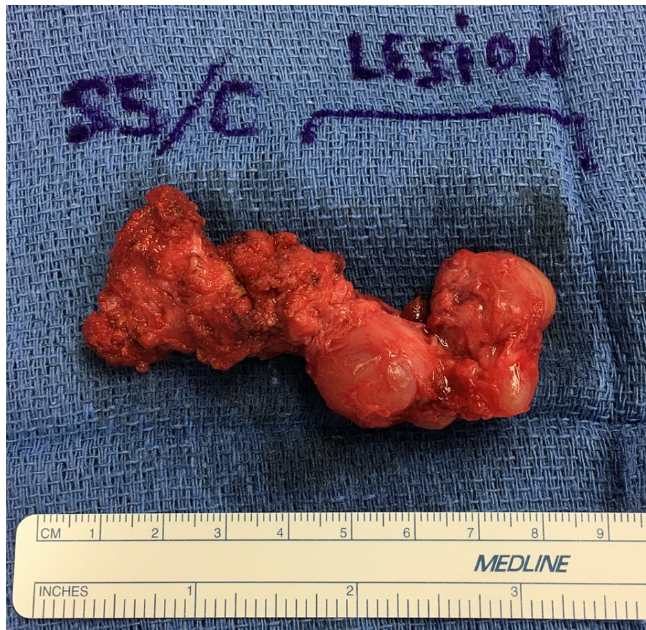
FIGURE 2: Gross image of en bloc resection including irregularly shaped cysts

Microscopically, the mass demonstrated columnar and squamous epithelium with no cellular atypia or significant mitotic activity. The cyst wall consisted of fibromuscular tissue with no desmoplastic changes. There was no evidence of malignancy, and the lesion was confirmed to be a benign retrorectal tailgut cyst.