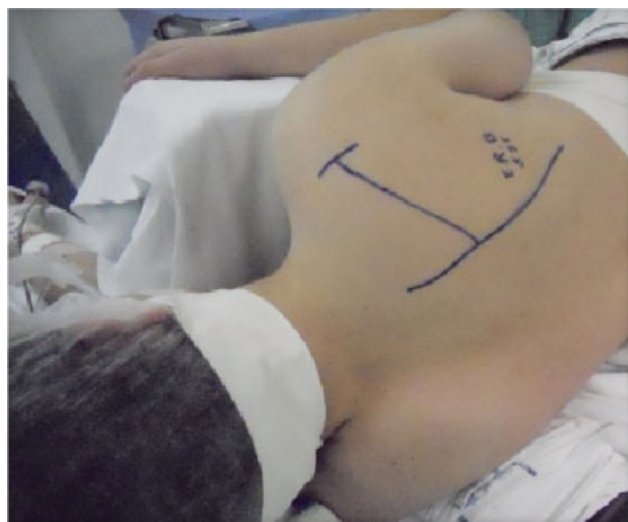
Fig. 2 Surgical planning of the incision.

region with an approximate evolution of 60 days and pain-induced impairment of the range of motion. About 10 days after the onset of the symptoms, the patient started to present intermittent, nocturnal fever, of \sim 38^{\circ}\text{C} ( 100.4\text{ F} ), which remitted with the usual antipyretics. The initial radiography showed a permeative lesion with lytic aspect at the body of the right scapula up to the medial border, with no cortical involvement or periosteal reaction. Imaging techniques were used to evaluate the extension of the disease. A computed tomography (CT) scan ( \rightarrow Fig. 1 ) also evidenced a permeative lesion in the location previously noted at the plain radiography, with no associated pathological fracture, infiltrating the adjacent soft tissues. A supplementary imaging study of bone scintigraphy confirmed the presence of a hyperuptake zone at the right scapula. A needle biopsy determined the diagnosis of bony histiocytic sarcoma with the analysis of anatomopathological and immunophenotypic markers.