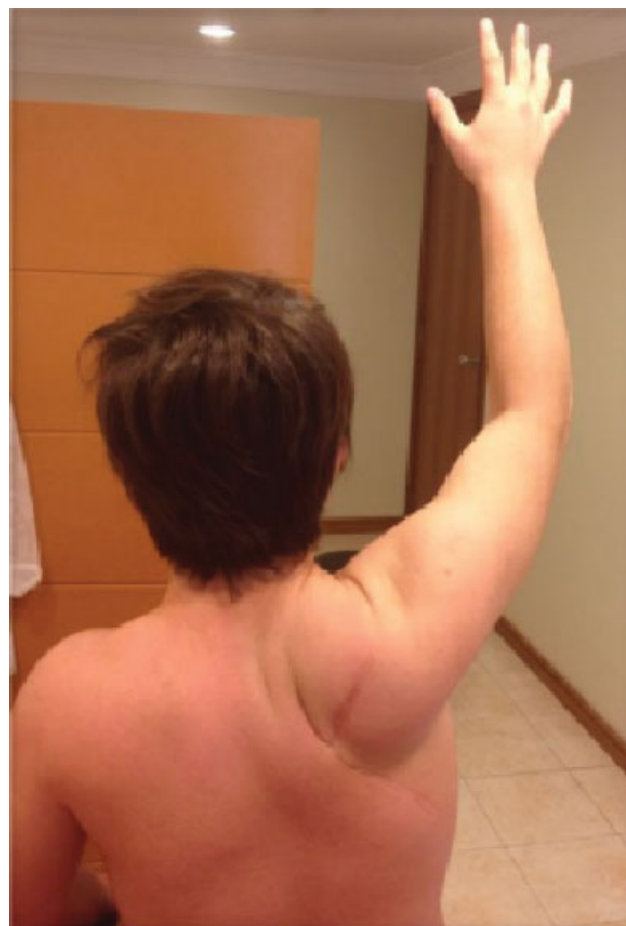
Fig. 4 Residual range of motion after surgical treatment and physical therapy.

A multidisciplinary team evaluation determined the pre-operative institution of neoadjuvant chemotherapy according to the protocol for Ewing sarcoma. The respective chemotherapy cycles were followed by the surgical treatment according to the modified Tikhoff-Linberg type II technique, with wide tumoral resection and partial amputation of the right scapula ( \rightarrow Figs. 2 and 3 ). The patient used a simple Velpeau immobilizer for 8 weeks after the surgery,